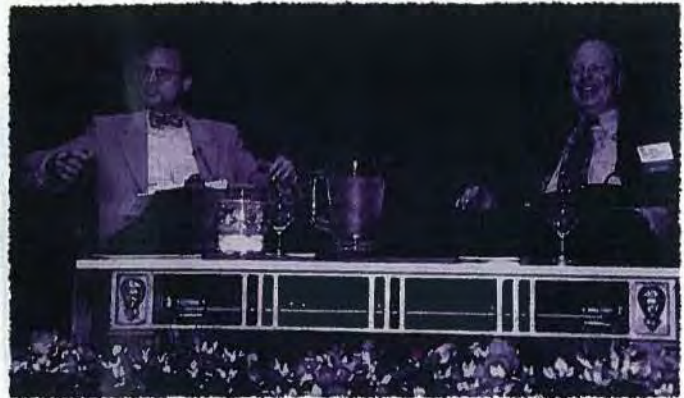
Rep. Earl Blumenauer

AMERICAN PUBLIC TRANSPORTATION ASSOCIATION