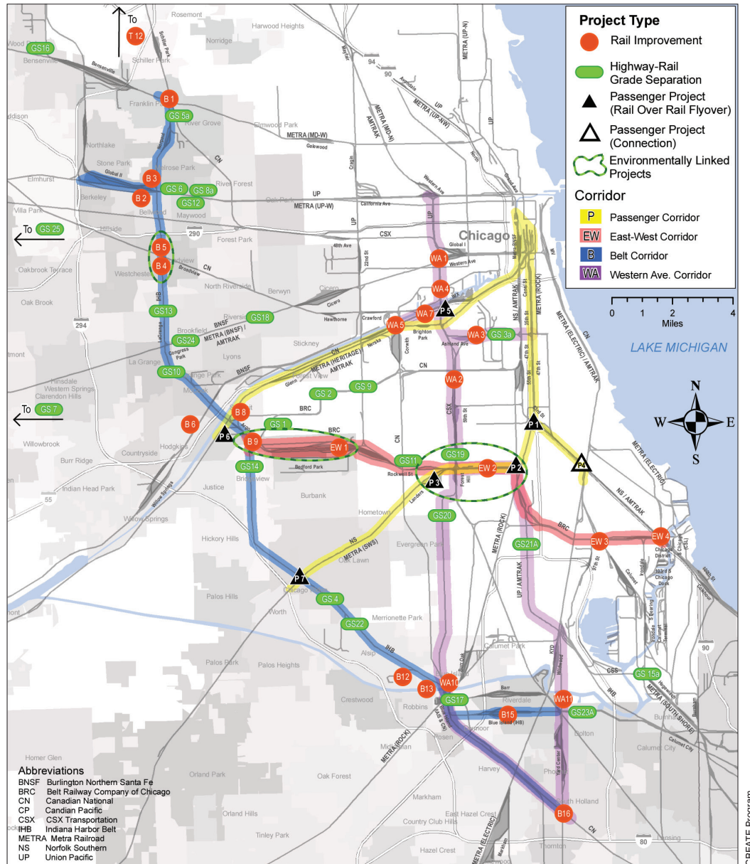
Streamlined train and road systems will reduce congestion in Chicago, which handles one-quarter of the nation’s rail volume.