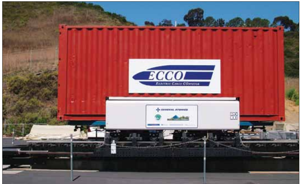
The electromagnetic cargo conveyor, an alternative to rail and truck, is tested in San Diego.

Consensus on the technology has not been achieved, and there are competing systems, such as the Texas Transportation Institute's Freight Shuttle. 7 Scientists and advocates of the ECCO technology suggest a blue-ribbon panel to determine the best technology. This consensus will shore up additional grant funding and improve the feasibility of the proposed corridor. 8