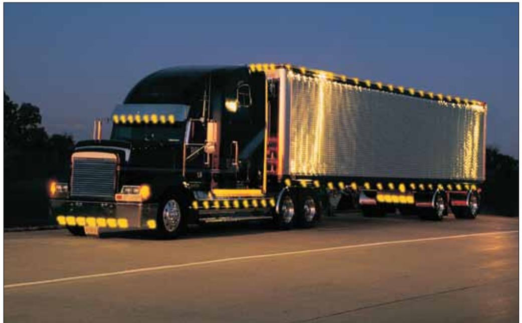
Technologies alone won't reduce emissions; partnerships are crucial.