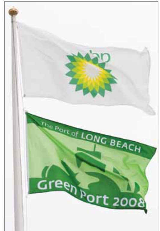
BP's shoreside power partnership with the Port of Long Beach reduces noise and auxiliary engine vibration, creating a cleaner work environment.

One challenge is the energy source for shoreside power. Unlike Gothenburg, the Port of Long Beach is supplied mostly through coal-fired power plants. While the port anticipates that the city's power source will become more environmentally friendly in years to come, this is an important consideration.