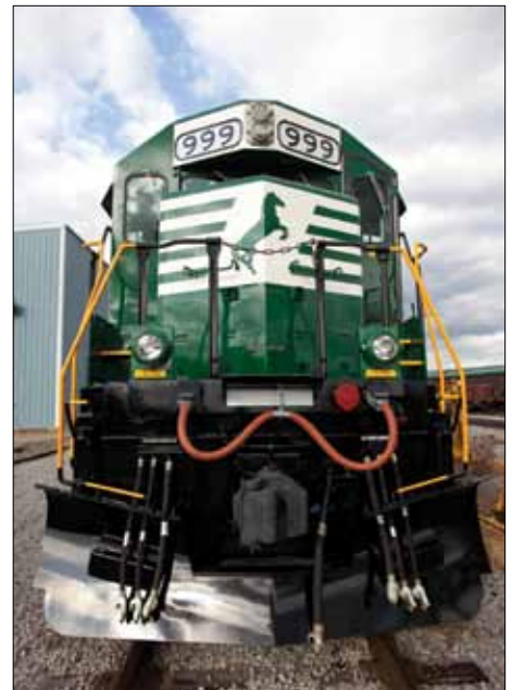
Testing of this zero-emissions battery-powered locomotive has yielded promising results.

This locomotive has reduced health impacts for those operating in or near the locomotive. The locomotive is also quieter.