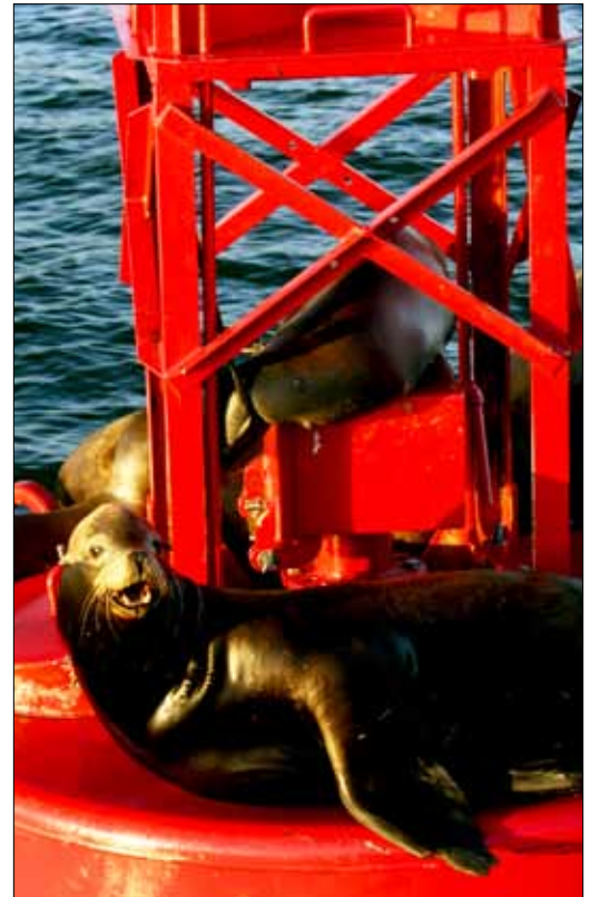
Port of Long Beach

This report highlights freight movement reforms that do not jeopardize—and in some cases even improve—a company's financial performance. With the right policies, innovations like those reported here can be adopted on a broader basis to benefit the environment and the economy.