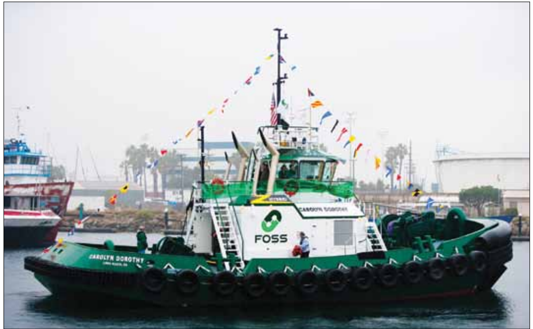
Port of Long Beach

Tugboats require only brief spurts of power, making them ideal for hybridization.