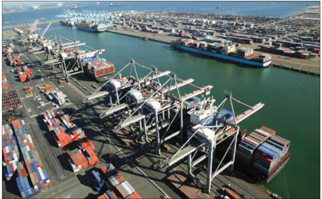
Port of Los Angeles

The ports of Los Angeles and Long Beach handle 45% of the nation's containerized goods. Cleaning up these ports will improve local air quality and reduce greenhouse gas emissions.