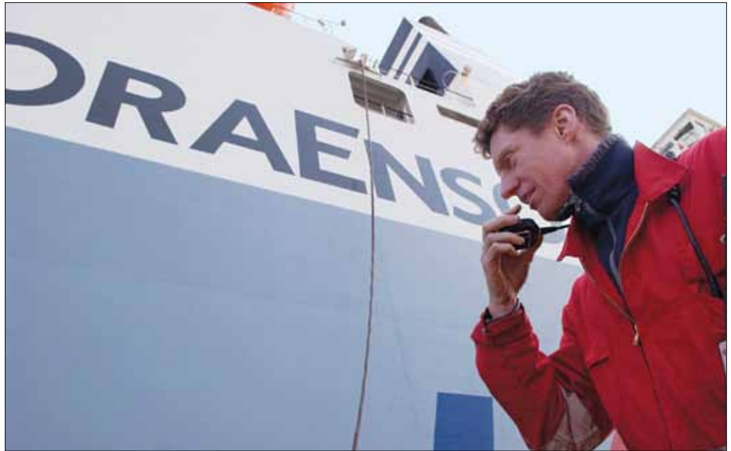
Port of Gothenburg

The Port of Gothenburg's shoreside power eliminates 882 tons of carbon dioxide annually.