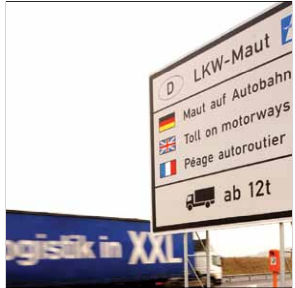
Germany's satellite-based GPS tolls truck drivers based on mileage, location, time of day, axels and emission category.

Germany's emissions tolling model has been replicated in other countries, including Austria and the Czech Republic.