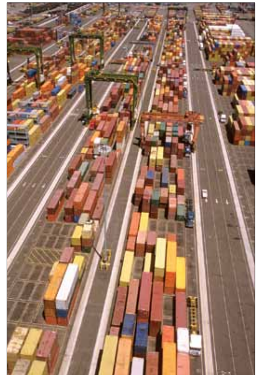
Port of Long Beach

Each mode of moving freight requires infrastructure, facilities and related ground equipment that add to greenhouse gas emissions, unhealthy pollution and congestion. Most of this equipment uses highly polluting fuels—either bunker fuel or high sulfur diesel fuel—and the turnover to new and cleaner engines is slow. The concentration of freight at various facilities also contributes to congestion, especially in metropolitan areas. By delaying shipments and slowing mobility overall, congestion affects not just the environment, but also the local economy.