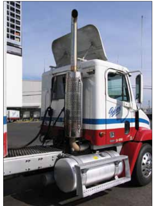
Providing incentives for add-on technologies, like this retrofitted exhaust pipe, helps existing engines run cleaner.

The Carl Moyer Memorial Air Quality Standards Attainment Program (Carl Moyer Program): California's Carl Moyer Program was created in 1998 when the state budget allocated $25 million to fund a lower-emission heavy-duty engine incentive program. Legislation enacted shortly thereafter established the statutory framework for the program. Eligible projects include retrofit devices or cleaner engines for on-road, off-road, marine, locomotive and stationary agricultural pumps. The program's focus is to achieve reductions of criteria and toxic pollutants, with the goals of helping the state meet its Clean Air Act commitments and improve public health. The program also reduces greenhouse gases by funding hybrid and electric vehicles and equipment. The California Air Resources Board administers the Moyer Program and is responsible for updating its guidelines.