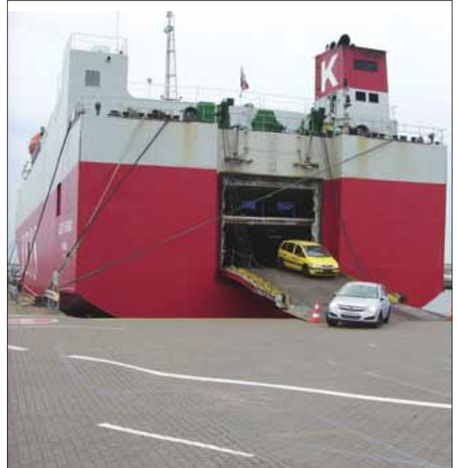
ROROs avoid congested highways and can transport bulky and hazardous goods safely.

The RORO network is funded under Marco Polo II, which provides 450 million euros for 2007–2013, or two euros per every 500 metric ton-kilometer (885.67 ton-mile) shifted from road to an alternative mode. 9 This particular program received 6.8 million euros from the Marco Polo Motorways of the Sea Program. Other partners include the transportation groups Spliethoff's Bevrachtingskantoor B.V. (Netherlands), Transfennica Iberia (Spain), Transfennica Belgium (Belgium) and Oy Transfennica AB (Finland).