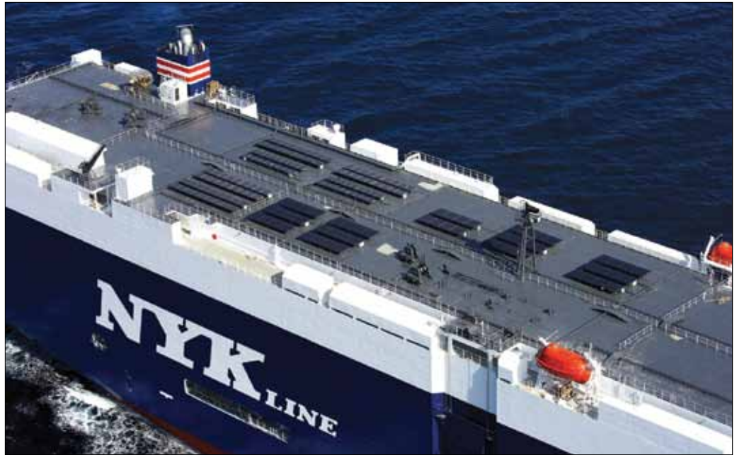
NYK's vessel is covered with 328 solar panels, which will save 18 tons of fuel oil per year