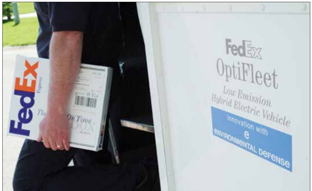
EDF's partnership with FedEx has helped purchase low emission, hybrid electric delivery trucks.

One of the largest impediments to widespread adoption of hybrids is their cost. A new typical medium/heavy-duty delivery truck costs more than $60,000; a hybrid electric costs more than