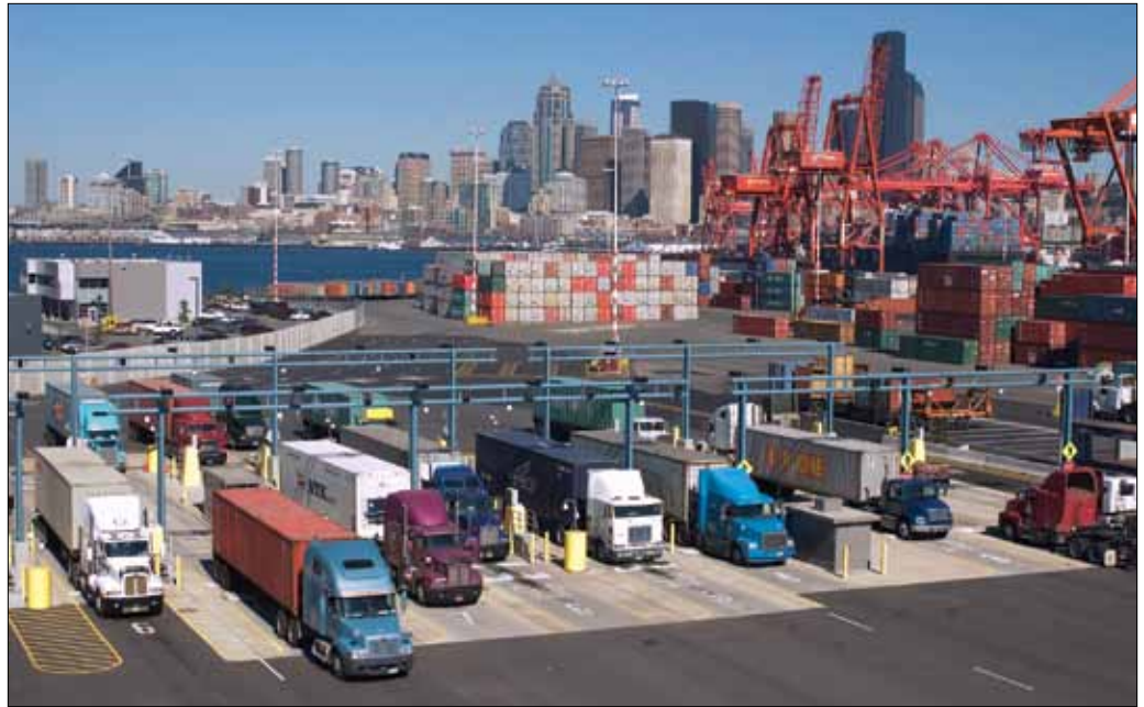
The Port of Seattle's Seaport Air Quality Program works to clean up all port-related activities and equipment.

sulfur dioxide emissions in the region, 28% of diesel particulate matter and 11% of nitrogen oxide emissions. Because the port is in attainment of federal standards, Seattle's Seaport Air Quality Program is voluntary. In addition to criteria pollutants, the plan also focuses on greenhouse gases. 25