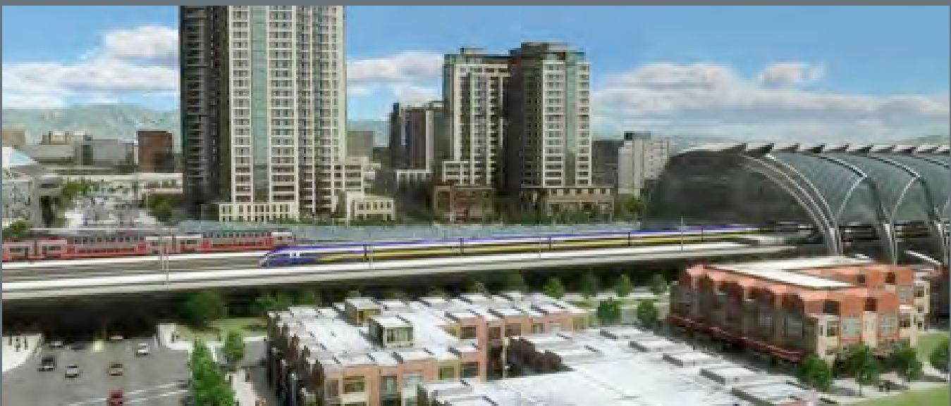
Rendering of Diradon Station and future HSR-oriented development.

See entire HSR TOD MarketPlace report: www.hsrtodmarketplace.org