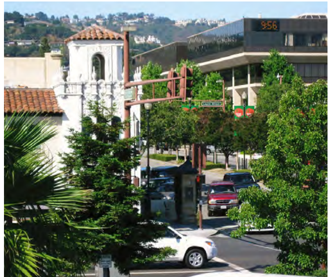
Downtown San Carlos has “good bones” for TOD, but the panel noted the need for improved pedestrian connections to the train station.

The City of San Carlos stands out as example of a city where targeted pedestrian improvements have the potential to help create a vibrant transit-oriented district. San Carlos is located on the San Francisco Peninsula and is home to just under 30,000 residents. The City's historic train station is served by a Caltrain commuter rail line that connects San Francisco, San Jose and the cities in between. The train station is separated from the City's historic core and commercial district by only a few short blocks, but a wide and busy street with an overabundance of surface