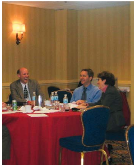
Workshop participants make connections across organizations.

A two-tier structure was also proposed as an effective way to structure a regional operations effort. One tier contains the core agencies that are required to make the regional operations effort happen. The other tier is composed of stakeholders who need to have input on the effort.