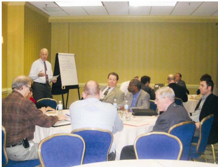
Participants develop approaches for advancing regional traffic incident management.

One of the greatest challenges brought up during the workshop was maintaining the regional operations effort after the loss of a champion, leader, or participant from a core participating agency. A workshop participant suggested that it is crucial to institutionalize the collaborative effort shortly after formation. Because champions and leadership can change quickly, many viewed this effort of institutionalizing as a race against time. Suggestions for institutionalizing regional operations included developing an RCTO or written agreement signed by key organizations that demonstrated commitment to the effort.