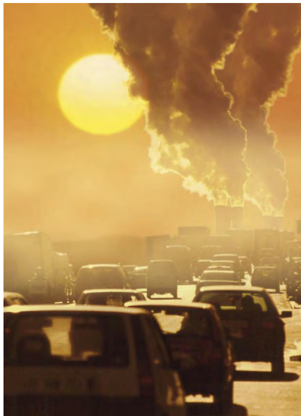
Regional operations can be advanced by leveraging larger issues such as climate change.

an incident or emergency. Homeland security initiatives are designed so that regions can respond to disasters, but if agencies in the region have not practiced with the new equipment and systems, these tools may not be used effectively when most needed. One participant noted that regional operations can benefit if localities put systems in place for use on a day-to-day basis so that they can be relied on during security emergencies. In Washington State, the state patrol uses a plane acquired for improved safety and security every day during peak periods to find incidents on the roads and chase down high-speed autos. The plane can communicate to the DOT, fire, ambulance, and others. It is the perfect resource for when an earthquake occurs or a bridge falls down.