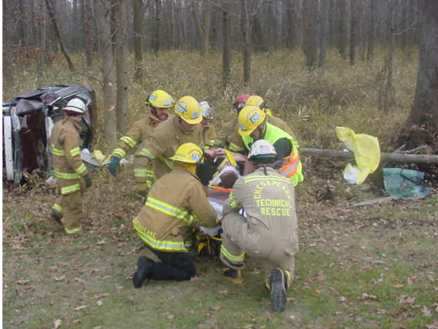
Traffic incident response in Hampton Roads, Virginia.