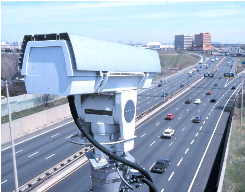
Local agencies in the Phoenix metropolitan area advance regional operations by sharing control of traffic cameras.

AZTech found that smaller agencies lacked the resources, staff, and systems for some of the regional operations initiatives that the group pursued. The larger agencies, such as Maricopa County DOT, were able to operate signal systems for the smaller agencies and to provide them with expertise and information. Another significant benefit of the AZTech partnership was the use of regional procurement contracts. There are an estimated 17 regional procurement contracts established that expedite procurement of goods and services for agencies in the region. The region collectively saved about $900,000 through joint procurement for a camera control system.