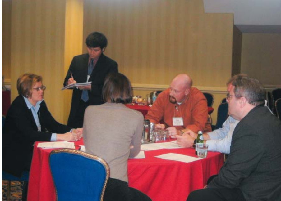
Workshop participants during a small group exercise.

the association wants to make sure that its members can move their freight as quickly as possible after an incident. For example, Washington State suffered a huge catastrophe and had to shut down Interstate 5 for days. An economic study was done afterwards in the region and found that many millions were lost as a result of the highway closure. While the area suffered financially, one benefit of the incident was increased momentum for a regional operations initiative within the state to help notify freight carriers and other travelers early enough that they can avoid the area in the event of a major incident. This momentum resulted in area operators putting together a plan for improving coordination and information dissemination during major events.