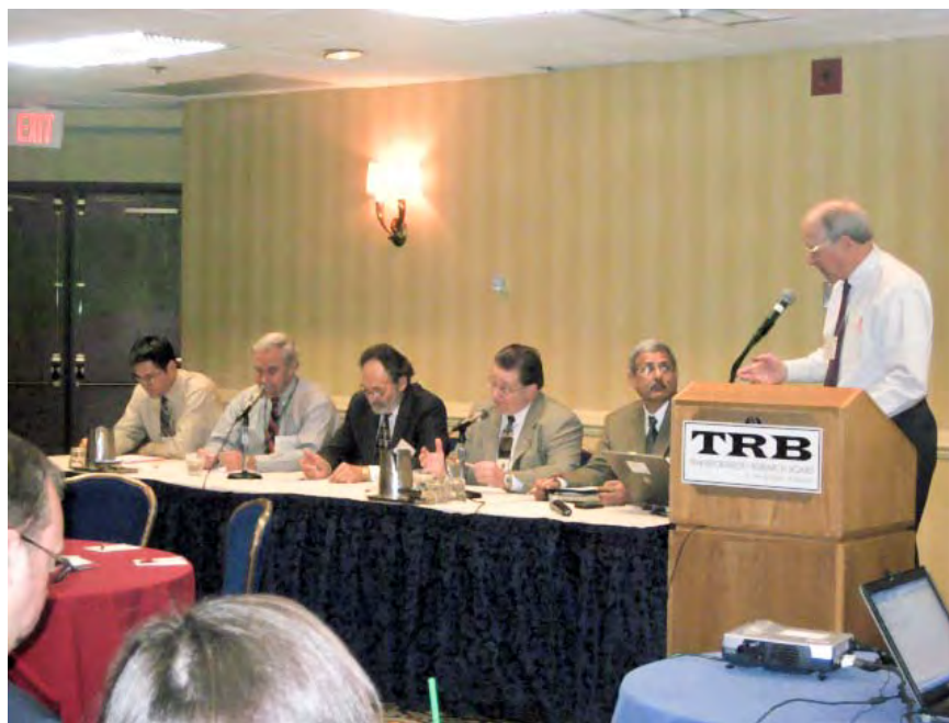
Panelists discuss implementing regional operations initiatives.

Equally important is the ongoing commitment needed to sustain management and operating strategies to improve transportation system performance in the region. Most infrastructure investments require periodic preventative or restorative maintenance—as do some TSM&O projects. However, management and operations strategies require day-to-day attention since they tend to be dynamic in nature and respond to current and anticipated conditions. As a result, management and operations strategies are often 24-hours-per-day, 7-days-per-week services that require constant oversight for them to be effective. For example, traveler information systems depend on collection, analysis, and dissemination of timely, accurate, useful, and accessible information about the current and anticipated condition of transportation facilities and equipment. Similarly, TIM requires surveillance, communications, response, and traveler information whenever and wherever incidents occur.