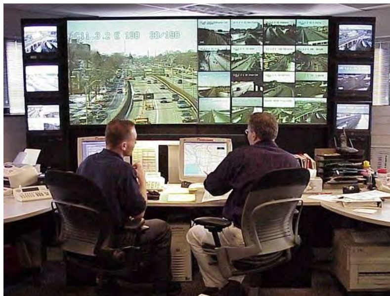
The NITTEC traffic management center.

NITTEC measures the performance of incident management on the region's roads, collects data on freeway and tollway volume and speeds, and tracks the performance of the ITS equipment used by NITTEC. Coalition staff prepare report cards for the member agencies on a monthly basis that contain performance information on the performance of the operations center and the performance of the ITS field systems. It uses standards and performance goals to guide the organization. Additionally, NITTEC collects and uses real-time information on the