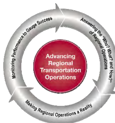
The three related aspects of regional transportation operations that were the focus of the workshop.

The National Workshop to Advance Regional Transportation Operations was organized around three fundamental and interrelated aspects of regional transportation operations. These three aspects (see figure, below) move transportation systems management and operations from concept to reality by focusing on the essential elements for improving transportation system performance. These aspects are “Answering the Who, What, and How of Regional Operations,” “Making Regional Operations a Reality,” and “Monitoring Performance to Gauge Success.” The boundaries between the three aspects of regional operations are blurred, and at times may blend together, but they were used to organize participants’ thinking about the topics. These three aspects are explained in greater detail in the sections that follow.