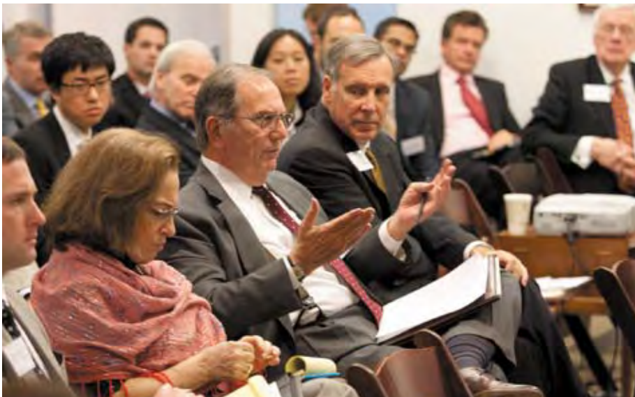
Conference participants respond to the advocacy plan.

5. Engaging new audiences in the transportation debate is critical in order to broaden the conversation. A thoughtful effort to identify and activate these audiences through social media should be strategically deployed.