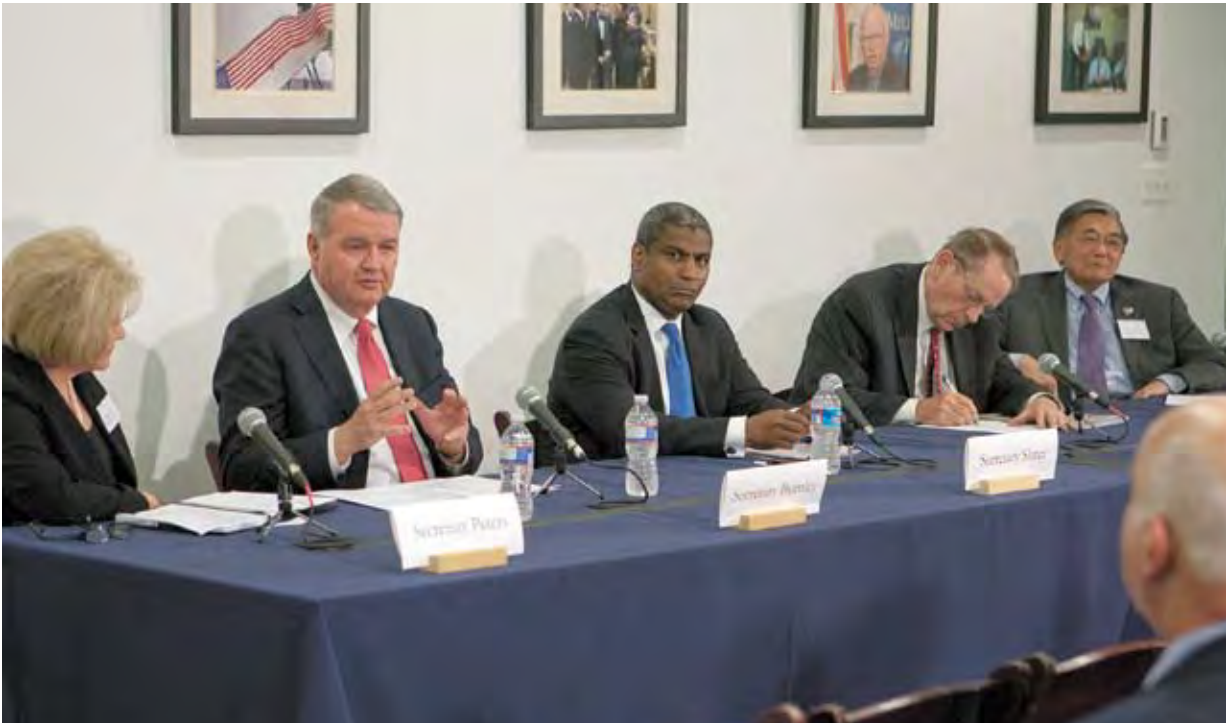
Secretaries Peters, Burnley, Slater, Skinner, and Mineta

Peters said that Congress has not increased the gas tax since 1993 because the public has lost confidence in Congress spending the funds in a way that they can see an improvement in the transportation system - a lack of investor confidence. Like the others, Peters emphasized the importance of highlighting projects where the public sees success, so they become aware of good returns on transportation investment.