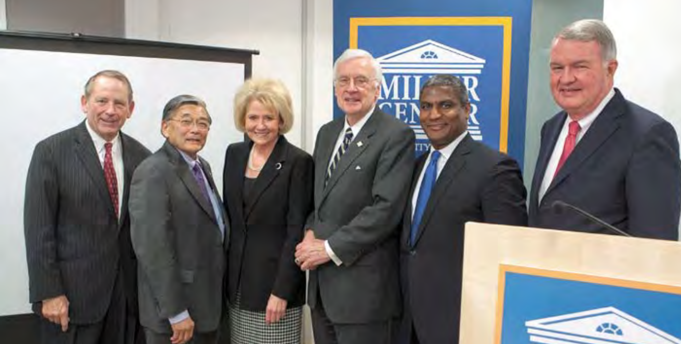
Gerald Baliles with Secretaries Skinner, Mineta, Peters, Slater, and Burnley

Our gathering was noteworthy for bringing together no fewer than five former secretaries of transportation—a first. Secretaries Norman Mineta, Sam Skinner, Mary Peters, Rodney Slater, and James Burnley shared success stories and lessons learned over 18 years of collective experience as the nation’s leading voice on transportation issues, spanning 22 years, five presidential administrations, and numerous political shifts in the U.S. Congress. A keynote address by Representative John Mica, chairman of the House Transportation and Infrastructure Committee, described the current state of the debate—noting positive and negative forces for progress in this Congress and the next.