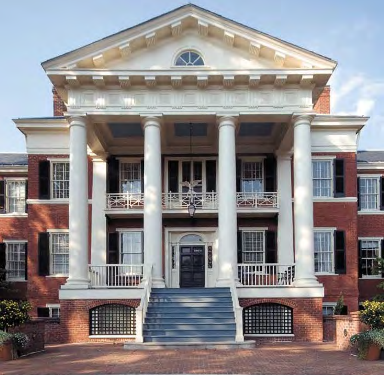
Faulkner House, home to the Miller Center, University of Virginia