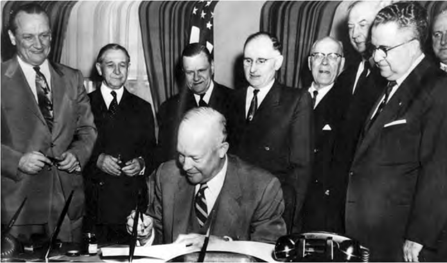
President Dwight D. Eisenhower signs the Federal-Aid Highway Act of 1954. The Interstate Highway System It is widely acknowledged as the greatest public works project in our nation's history.

The 2011 David R. Goode National Transportation Policy Conference caught the U.S. transportation policy debate at a crossroads in its decades-long history. Lack of progress on a transformational policy agenda combined with a sense of urgency about the need to maintain and improve the nation's transportation infrastructure had both frustrated and energized conference participants. They agreed that another plan or more supportive rhetoric was not necessary. What is needed is tangible action. This report reflects that focus. It proposes a set of practical, actionable recommendations grounded in the themes that consistently emerged over two days of conference discussions.