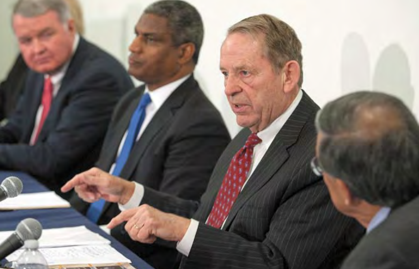
Former Secretaries of Transportation James Burnley, Rodney Slater, and Norman Mineta listen to observations about the need for better communications from former Secretary Samuel Skinner.

tial election is only months away. Congressional reauthorization of existing transportation programs is long overdue, even as congressional interest in ways to accelerate the economic recovery and jump-start job growth remains high.