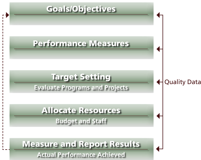
Figure 2.1 Performance Management Framework

Achieving the best level of performance with this process depends on several factors: