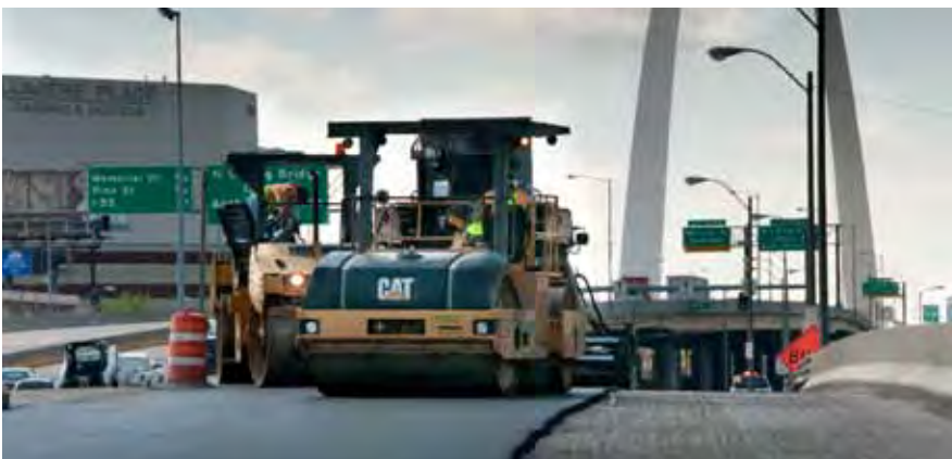
Road construction using warm-mix asphalt

“A review and accountability meeting, attended by over 150 managers and employees, is held quarterly to report and discuss the results of the metrics.”