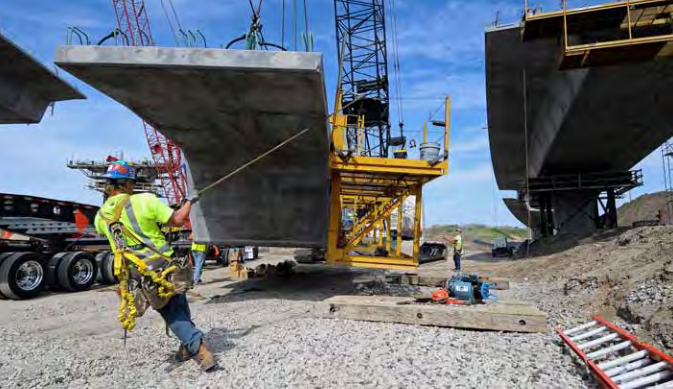
Precast section brought into position Hwy 62 Minneapolis, MN