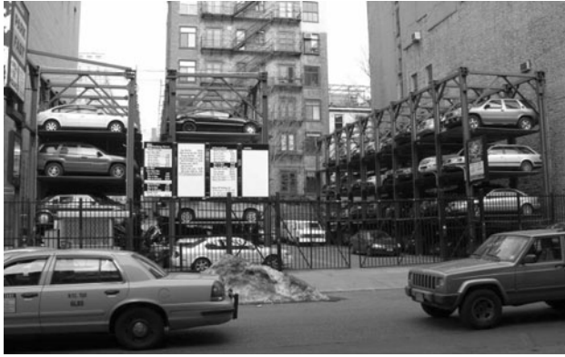
Figure 3. Carstackers in a dense urban environment.

ical garages, as illustrated in Figure 3, can increase parking density.