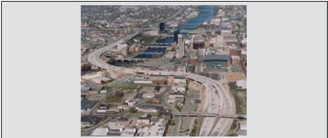
Figure 6. Grand Region, US 131 Grand Rapids S-Curve Replacement.