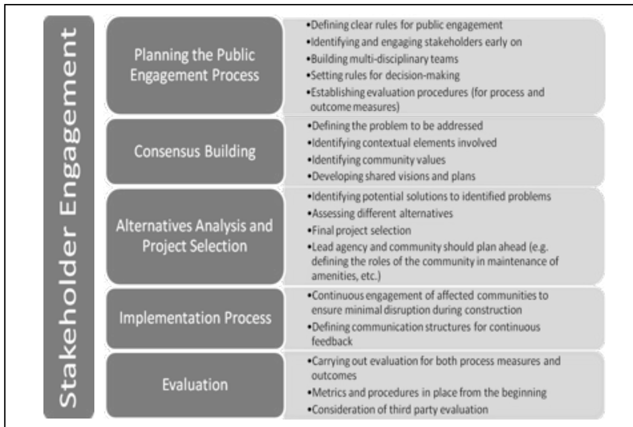
Figure 7. Flowchart of the Stakeholder Involvement Process.

Early involvement of stakeholders is seen to be of critical importance because decisions made during the early stages of project development can constrain the range of potential alternatives to be considered as well as “limit the flexibility available in the later design stages” (Nehuleni 1999).