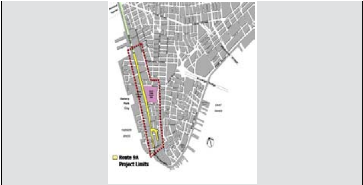
Figure 3. New York Route 9A

This reconstruction project spans a 5.7-mile section of Route 9A (also known as the West-side Highway), which extends along the Hudson River waterfront between Battery Place and 59th Street. The multimodal project includes a street-level six- to eight-lane north-south boulevard and a continuous bikeway and walkway, and it accommodates cars, trucks, buses, bicycles, pedestrians, and various recreational users. Average daily two-way traffic volumes range from 69,000 to 81,000 motor vehicles, demonstrating the importance of Route 9A to this metropolitan region (Eastern Roads, n.d.).