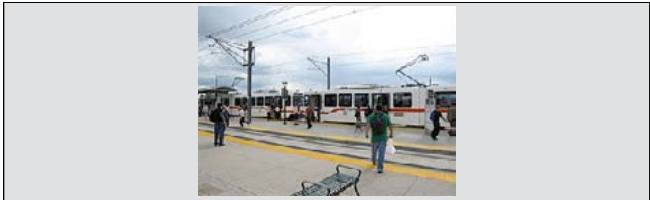
Figure 5. The T-REX Rail Line, Parallel to the Highway

The population growth rate of Denver's metropolitan region has consistently outpaced the national rate every decade since the 1930s. The region grew steadily in the past 10 years, averaging 1.9 percent population growth each year from 1999 to 2009. The current population exceeds 2.8 million people, and by 2030, it is anticipated to increase to almost 3.8 million (MetroDenver, n.d.). The T-REX project, which includes the "Southeast Corridor" in the Denver Metro area, connects the bustling downtown Denver Central Business District and the Southeast business district. These two major employment centers concentrate more than 180,000 people on a daily basis, plus approximately 30,000 additional workers employed along this corridor, which is expected to continue to grow over the next 20 years (RTD, 2007).