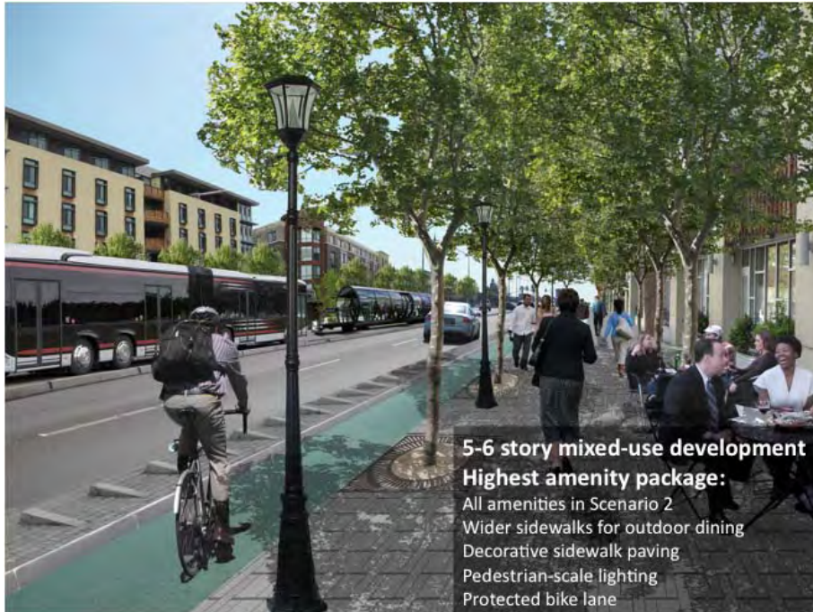
Figure 11. Pacific Ave - Scenario 3