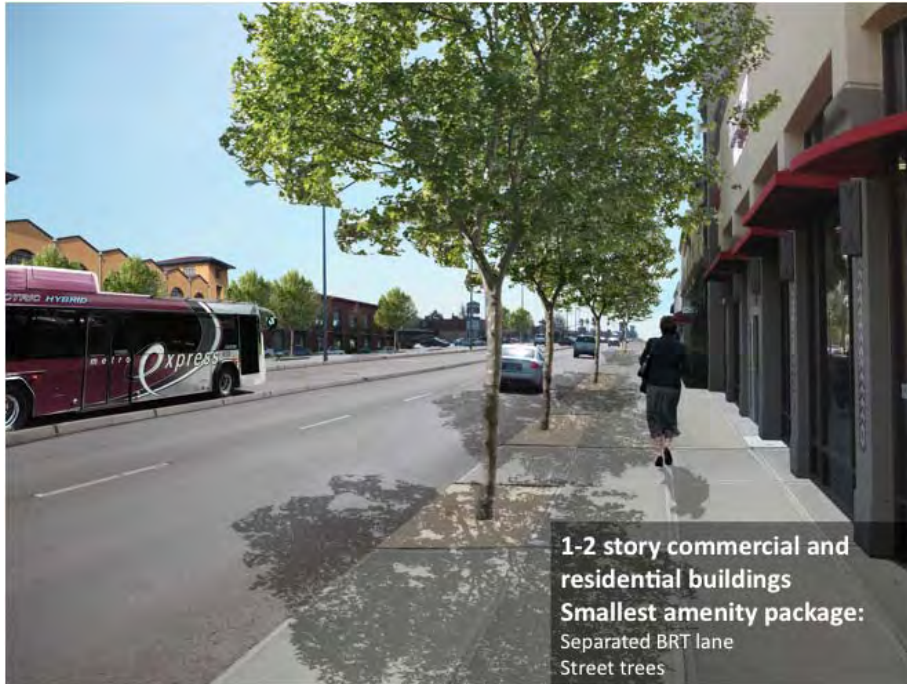
Figure 9. Pacific Ave - Scenario 1