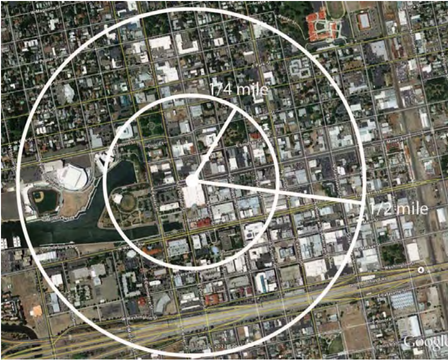
Figure 2. Miner Avenue at El Dorado Street - Walk Sheds

number is primarily composed of jobs per acre, not residents, given the large number of employment centers downtown). The three photo simulations below (Figures 4, 5, and 6) depict the possible density configurations that could occur with various BRT investments.