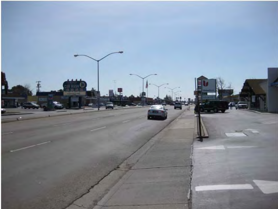
Figure 8. Pacific Ave - Existing Conditions