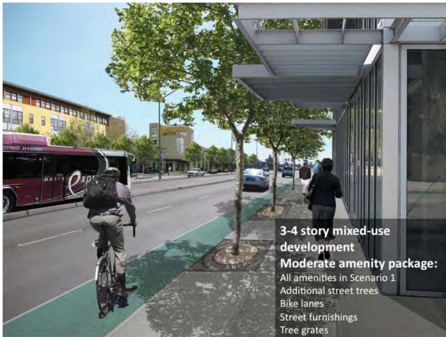
Figure 10. Pacific Ave - Scenario 2