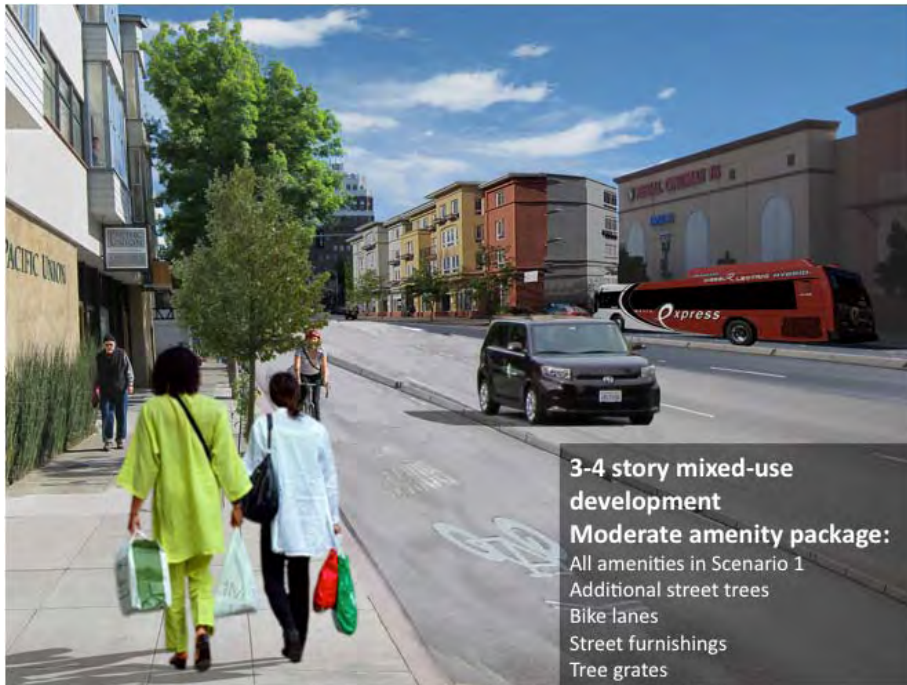
Figure 5. Miner Ave - Scenario 2