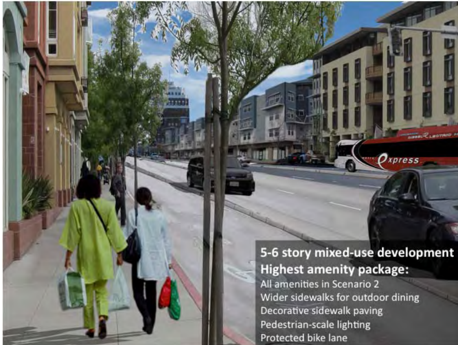
Figure 6. Miner Ave - Scenario 3