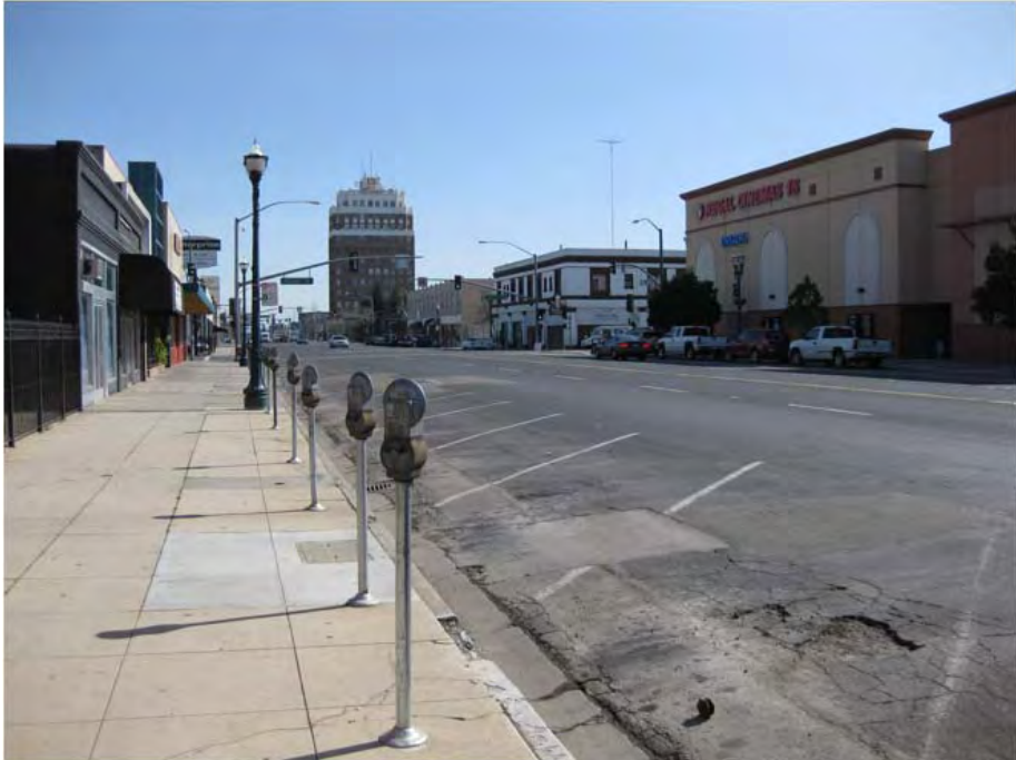
Figure 3. Miner Ave - Existing Conditions