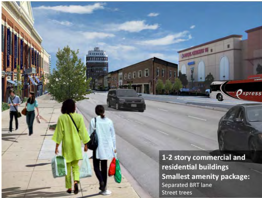
Figure 4. Miner Ave - Scenario 1