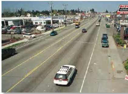
EXHIBIT 5 Project Alternatives for the Example Application

Exhibit 5 illustrates and describes the three project alternatives: a no-build scenario, Alternative 1 and Alternative 2.