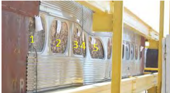
Figure 5. Deformation of Car 244

As shown in Figure 3, these variations in the deformation do not have much influence on the crippling load. The permanent deformation can be focused at several locations, but the crippling load is essentially the same regardless of the location of crippling along the length of the rail car.