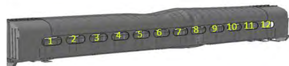
Figure 3. Predicted Carbody Deformation

Different modes of deformation were observed in both tests, and the mode of deformation in the FE model replicated well the observations from one of the tests. Figure 3 shows the FE analysis prediction for the deformation of the car. Figures 4 and 5 show the posttest deformations of cars 248 and 244, respectively.