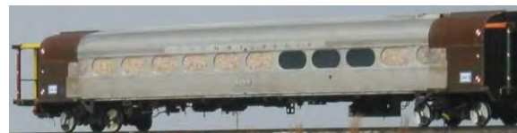
Figure 1. Pioneer Car 244

The car design chosen for this research is the Budd Pioneer. This design is a single-level passenger car that complies with the existing 800,000-pound requirement. The cars chosen for this research have been retrofitted with CEM elements. These CEM elements shift the collision load path through the car away from the line of draft. The CEM-equipped ends of the car were removed in the crippling FE model and tests to permit loading along the collision load path. Figure 1 shows Pioneer 244 prior to removal of its end structures.