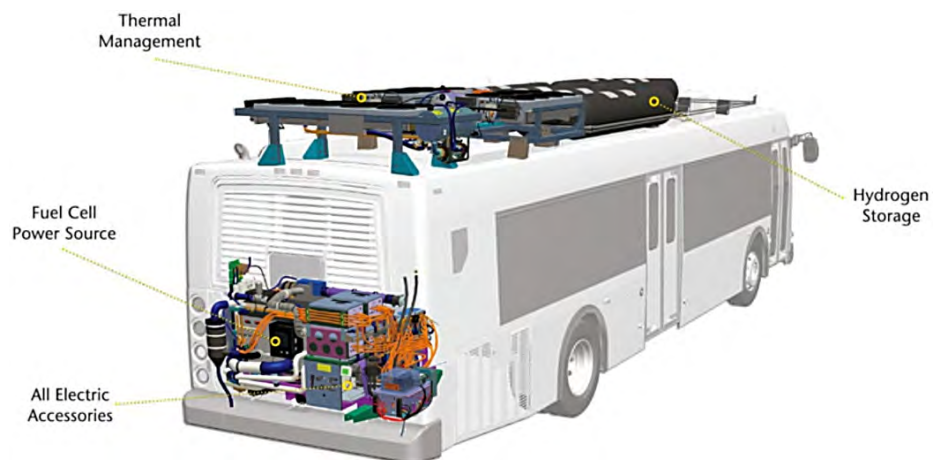
Figure 3-1 BLUWAYS/ISE Hybrid Drive integrated in fuel cell hybrid bus

Figure 3-1 shows how the ISE hybrid drive is placed in the complex architecture of a fuel cell hybrid bus. Figure 3-2 shows the modular LIBs linked to the ISE BLUWAYS proprietary BMS/TMS controller module. 36