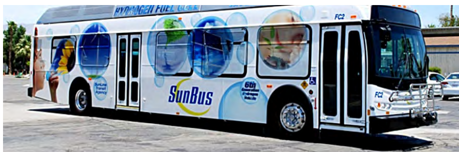
Figure 3-4 SunLine Fuel Cell Bus

The AFCB project 44 will add a more advanced FCB to the SunLine (Thousand Palms, California) transit fleet. Its partners are FTA, CALSTART, BAE Systems as the series hybrid power and propulsion system integrator, El Dorado National and Axess as the bus manufacturers, and Ballard Power Systems 150 kW as the fuel cell manufacturer. In 2011, SunLine also received an FTA TIGGER grant award for two additional FCBs. El Dorado National will manufacture and deliver the buses by 2013. 45