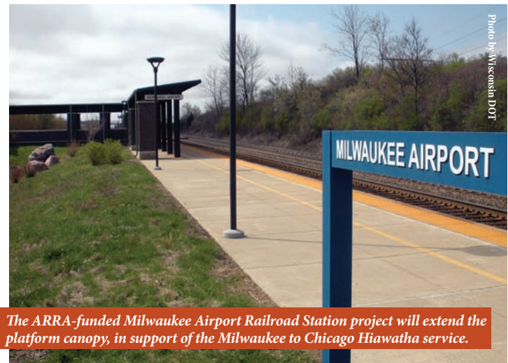
The ARRA-funded Milwaukee Airport Railroad Station project will extend the platform canopy, in support of the Milwaukee to Chicago Hiawatha service.

In Illinois, track, signal, station, and rolling stock improvements will help implement faster, 79- mph service in the corridor from Chicago to Moline. Similar work will offer sustained 110-mph passenger rail service on the “Lincoln Service” corridor from Dwight, Illinois, to St. Louis. Work has been underway since the fall of 2010 to upgrade all Union Pacific track on the corridor with concrete ties, premium rail, and improved crossing surfaces.