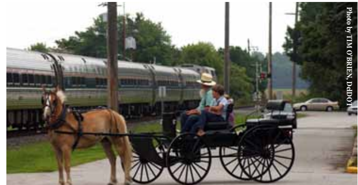
Delaware's 2004 Rail to the Fair excursion vicinity of Wyoming, Delaware.