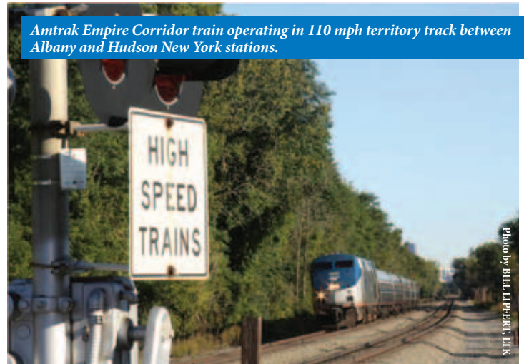
Amtrak Empire Corridor train operating in 110 mph territory track between Albany and Hudson New York stations.