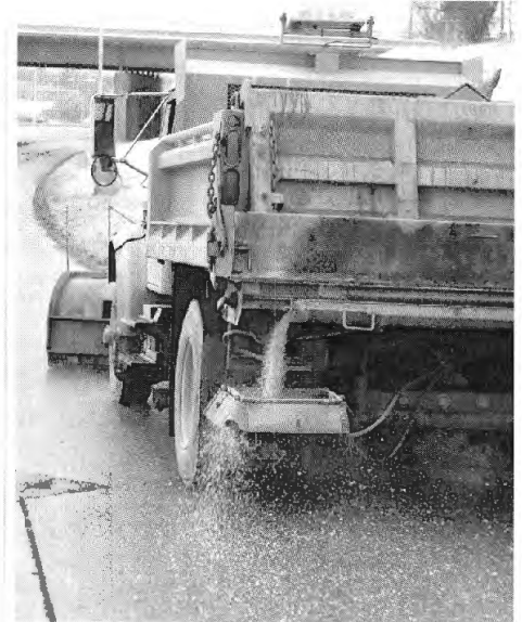
The correct salt application rate saves money.

“Computer-based training lends itself so well to technology transfer for research,” says Lee Smithson, who helped develop the training module through AASHTO’s Snow and Ice