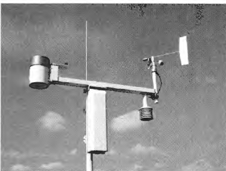
Weather station data shape appropriate storm response.

The result was a set of detailed guidelines that gave state DOTs and local agencies a scientific methodology for addressing