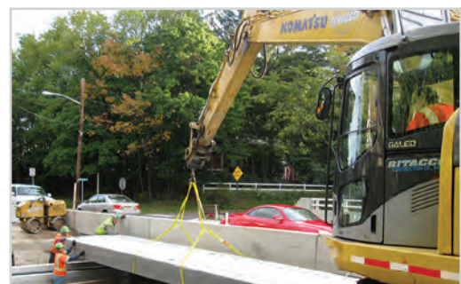
A hybrid-composite beam is lowered into place as a New Jersey bridge takes shape. The NCHRP IDEA Program (Project 20-30) helped put the innovative new bridge beam concept into practice.

In addition, HC Bridge Company, LLC, and three partner organizations (including TRB) won the 2013 Charles Pankow Award for Innovation for their hybrid-composite beam (HCB). The NCHRP IDEA Program provided partial funding for the manufacturing and testing of a prototype HCB bridge for railroad and highway applications. The HCB weighs one-third as much as concrete beams and can hold 50 percent more weight. Presented annually by the American Society of Civil Engineers, the Pankow Award recognizes the contributions of organizations working collaboratively to advance the design and construction industry by introducing innovation into practice.