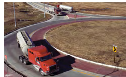
Large freight vehicles were a design consideration for a roundabout in Florence, Kan.

For more information about this NCHRP research or to download these reports, please visit www.trb.org/nchrp .