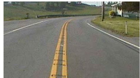
Iowa drew from NCHRP Report 641 in developing designs for shoulder and centerline rumble strips.

Younie finds NCHRP syntheses of state practices particularly valuable. " NCHRP Synthesis Reports do a tremendous job of capturing the national state of practice," he says, "and show us how well Iowa is aligned with practices in other states."