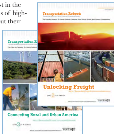
Study 52 was the basis of strategic tools addressing different aspects of capacity.

sometimes seem lost in the overpowering needs of high-population areas, but their transportation and production networks actually serve the entire country,” he says. “The Interstate system is aging, yet it is absolutely vital to the health and security of the country. The system will need to be a priority for future funding, as the report points out.”