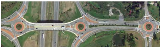
A five-roundabout corridor in Malta, N.Y., includes Interstate on- and off-ramps.

mational Guide, Second Edition in 2010. The document serves as an update to the FHWA guide and is based on a large number of new roundabouts in America. “For example, Kansas DOT’s experience in designing highway roundabouts for heavy freight vehicles was one of many important updates to the guide,” says King.