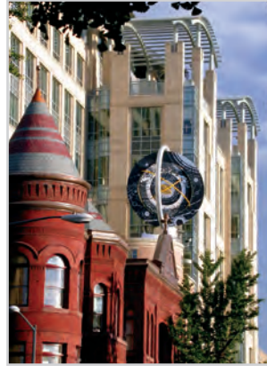
TRB is headquartered at the Keck Center of the National Academies, 500 Fifth St. NW, Washington, D.C.

Once research starts, administrative and technical oversight of progress is performed by NCHRP staff, consisting of 16 full-time employees assigned exclusively to NCHRP and 20 additional employees who split their time among all of the TRB cooperative research programs. In-depth oversight by project managers with wide-rang-