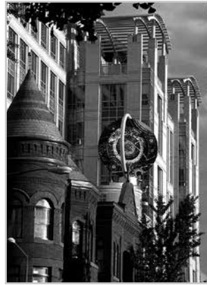
TRB is headquartered at the Keck Center of the National Academies, 500 Fifth St. NW, Washington, D.C.

Once research starts, administrative and technical oversight of progress is performed by NCHRP staff. In-depth oversight by project managers with wide-ranging expertise is an important factor contributing to project success.