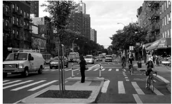
Among many other updates, the 2010 Highway Capacity Manual gives users tools to incorporate bicycle and pedestrian planning into their traffic engineering decisions.

“Focus groups provided critical insights into the content and organization of the manual.”