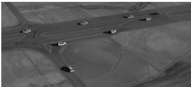
J-turns significantly improve rural highway intersection safety by preventing drivers from directly crossing medians and requiring them instead to make a right turn followed by a U-turn.

Median-separated highways provide distinct advantages over undivided roadways by separating traffic, providing a recovery or stopping area for vehicles, and providing space for left-turn vehicles. In many cases, they also provide the same safety and travel time benefits as rural interstates at a lower cost. However, these safety benefits can be diminished by an increase in the frequency and severity of intersection crashes, especially right-angle crashes that occur while a vehicle from a minor road is making a left turn through the median and onto the highway.