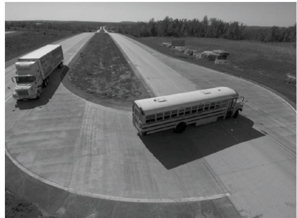
Some J-turn treatment U-turn designs involve bulb-outs to accommodate larger vehicles.