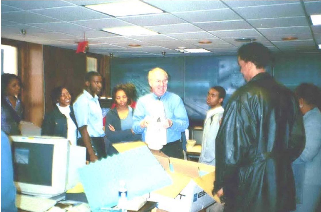
Figure 2-2. Inspecting a traffic surveillance camera at the Birmingham Traffic Management Center