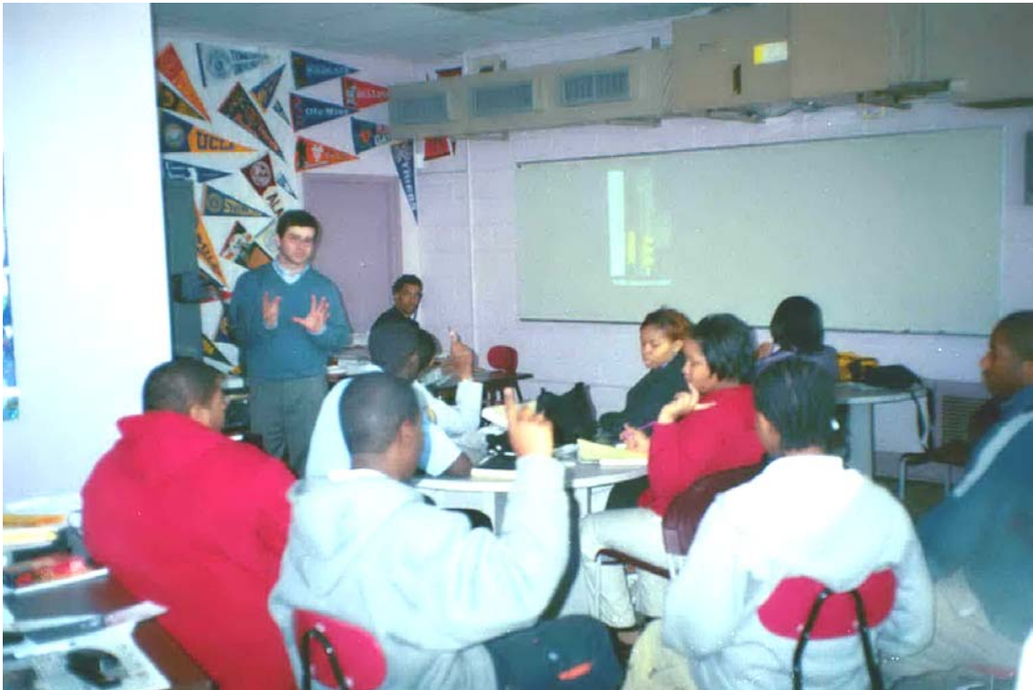
Figure 2-1. Delivery of two of the lectures at Jackson-Olin High School