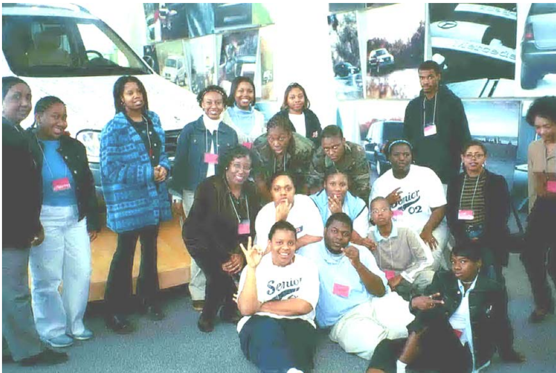
Figure 2-3. Field trip to Mercedes-Benz plant in Vance, Alabama