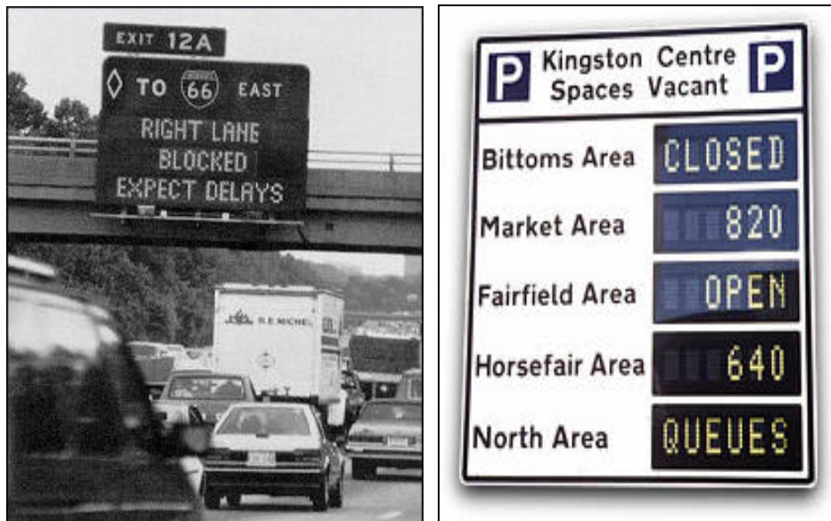
Figure 4-2 Example Variable Message Signs

(MUTCD). The MUTCD states that the driver should be able to read the message at least twice while traveling (MUTCD, 1989). The VMS should be within the driver's cone of vision to be identifiable. The use of fiber optic technology, fuel cells, light emission diodes, and other emerging technology will continue to enhance VMS. Two examples of VMS are shown in Figure 4-2.