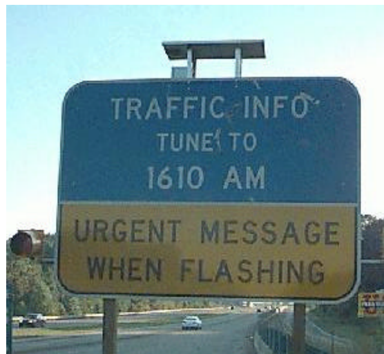
Figure 4-1 Message Board Indicating HAR Radio

HAR is a real-time tool used to update travelers on travel information through a radio broadcast. The FCC licenses HAR as a Travelers Information Station (TIS). Its main applications include maintenance/construction zones, traffic advisories, route diversions, special events, weather advisories, and tourist information. HAR stations are operated with low-power transmitters placed along the roadside. Advisory signs are used to inform the driver of the existence of HAR. These signs also provide the station's frequency so drivers can tune their radios to receive traffic information. Figure 4-1 is an example of a HAR notification sign.