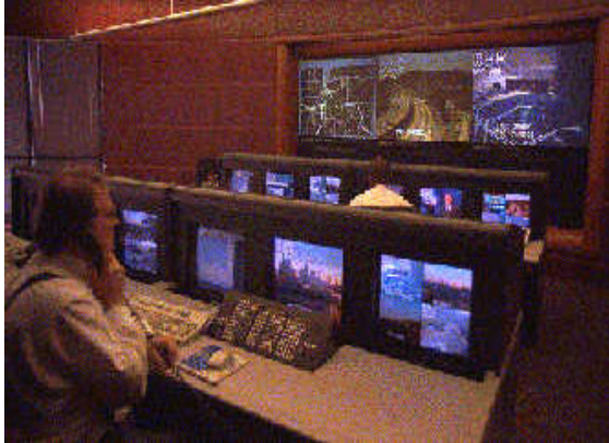
Figure 4-3 Photos of NAVIGATOR Center and HERO Vehicle

NAVIGATOR utilizes VMS at key decision-making points on area interstates, where operators can inform motorists of travel times and display incident messages. These messages are updated every two to three minutes to allow motorists to make informed decisions about alternate routes. NAVIGATOR reaches the cities of Atlanta, Athens, and Savannah, and will be expanded to other cities (Atlanta NAVIGATOR, 1998). Figure 4-3 shows a NAVIGATOR traffic management center and a HERO response vehicle.