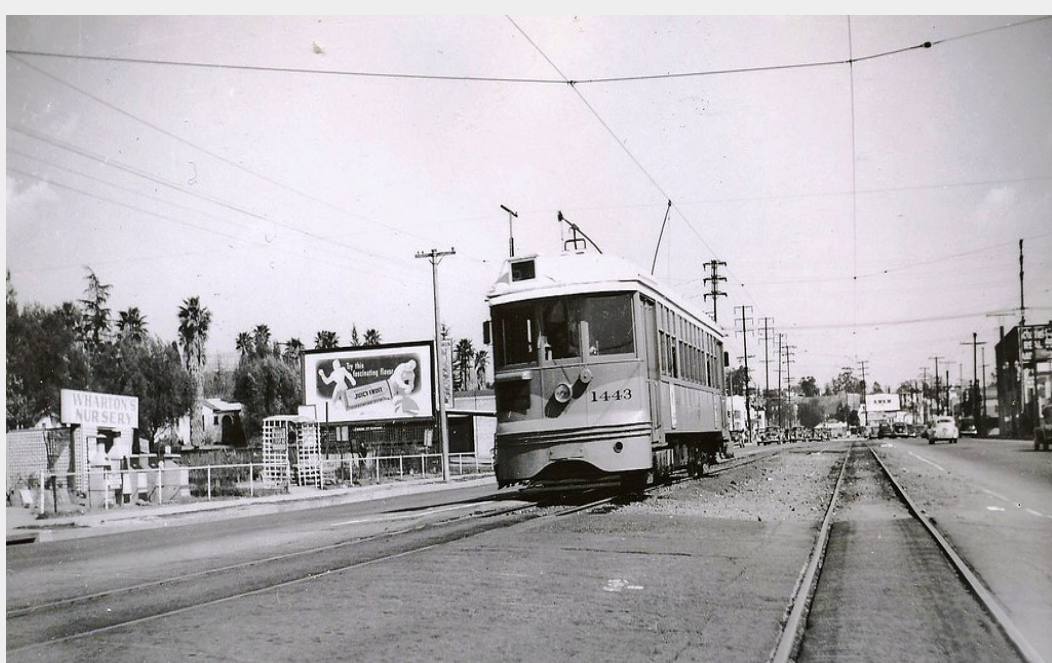
— A westbound yellow-car running down the center of Colorado Boulevard.

Yes, we do have bus lines, but they tend to be slow and get stuck in traffic caused by too many cars on the road. Unlike the buses of today, the streetcars we fondly look back upon operated in a dedicated right-of-way. In other words, by having their own lanes, the trolleys of yester-year were separated from car traffic and were less likely to get stuck in traffic. So while our yearning for rail stems partially from nostalgia, it also comes from an understanding that public transit works best when it has quality dedicated infrastructure.