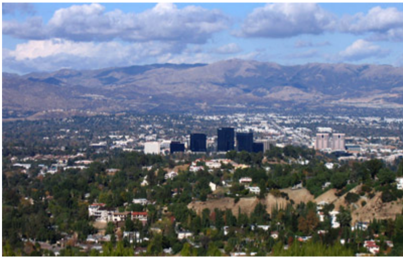
View of Warner Center

Yet even though its recommendations remain largely unrealized, the plan continues to serve as a powerful reminder of an interesting and important chapter in the history of a modern day metropolis struggling to nudge its auto-oriented landscape (and even more auto-oriented population) in a new direction. The ideas contained within the plan's pages – many of which are still considered sapient by today's standards of sustainability and livability – certainly speak to the progressive vision that some planners have tried to advance in Los Angeles.