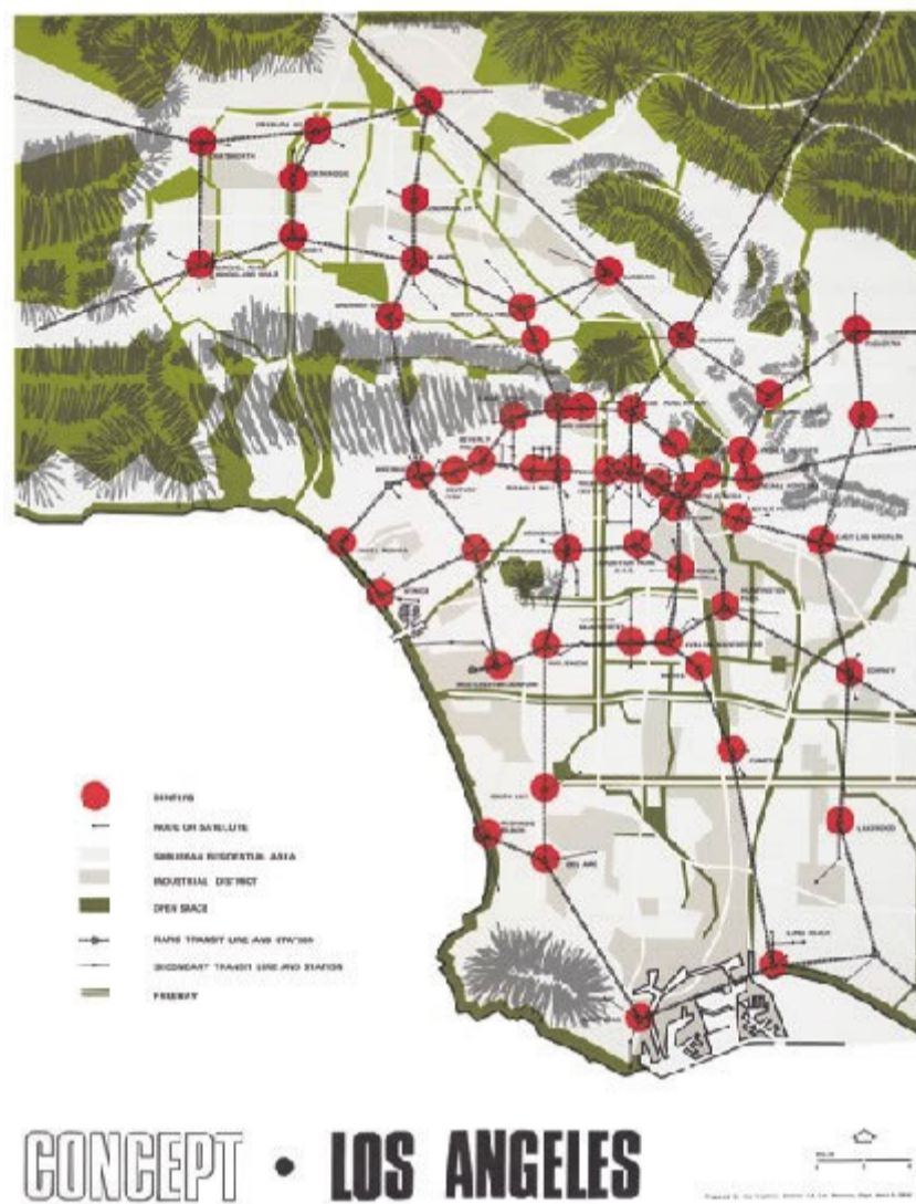
Proposed regional centers and transit blueprint from the Concept Los Angeles General Plan