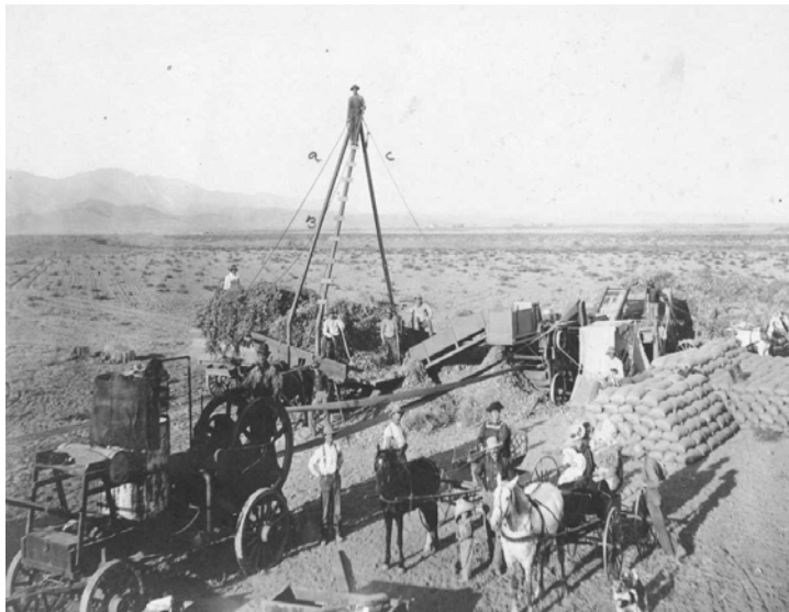
Harvest time near Santa Ana, Orange County, 1915

Research Note: Source for study of finances in general and for specific investigations of agency expenditures and revenues, purchasing patterns, and rising cost of goods and services.