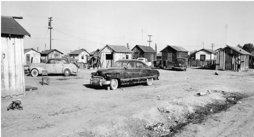
Farm labor camp, Fresno County, ca. 1960s

Research Note: Supplement to case files and a source of legal and social history. Provides useful summary of court proceedings in a given case.