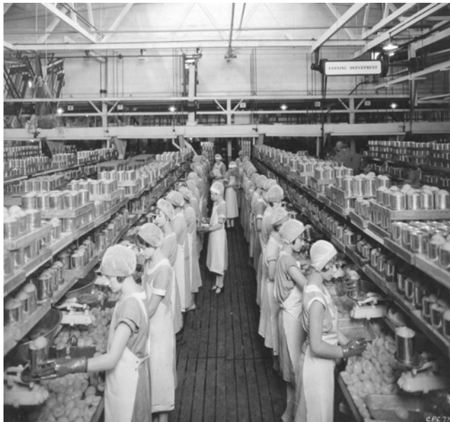
Canning peaches, San Joaquin Valley, ca. 1920s

Research Note: Useful source for a study of legal positions as a basis for county policy and for analysis of types of issues brought to district attorney's office for evaluation.