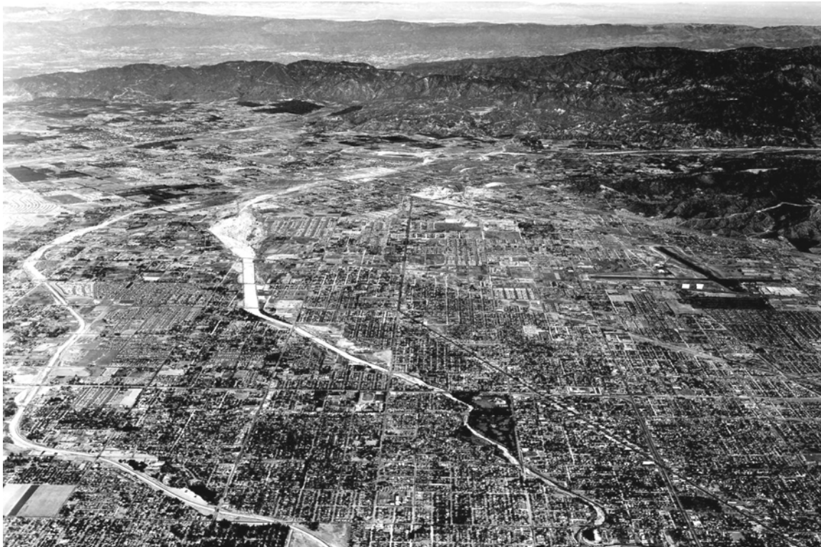
San Fernando Valley, ca. 1950s

Research Note: Source for study of land use policies and urbanization. Includes information on land development by local businesses.