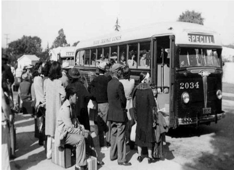
Japanese residents of Los Angeles County board a bus for a relocation center, 1942.

Research Note: Useful source of cartographic information on department activities. Helpful in understanding reports and studies. Also provides information about property boundaries.