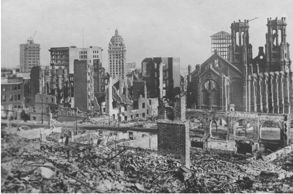
San Francisco after the great earthquake and fire, April 1906

“These records are created in connection with the day-to-day functions of public offices, but many of them . . . have value for purposes for which they were never intended . . . Records of local government constitute America’s cupboard of unspoiled goodies . . . the richness of which is concealed by their classification as simply ‘old records’. These hundreds of millions of documents have suffered in varying degrees – from natural deterioration, from the elements, from vermin, from theft, from human neglect or deliberate destruction – but those that remain in the county courthouses and city, town, and village halls of the nation conceal the unwritten and unknown history of America.”