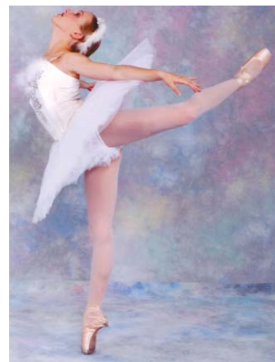
Log on to www.lpac.org to learn about the many events available at the Lancaster Performing Arts Center.