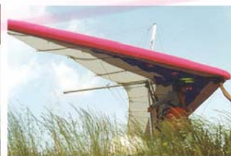
Daily commuter Sally Tucker paraglides in her free time.

▶ 1,600 men are expected to be diagnosed with breast cancer this year and 400 are predicted to die from it.