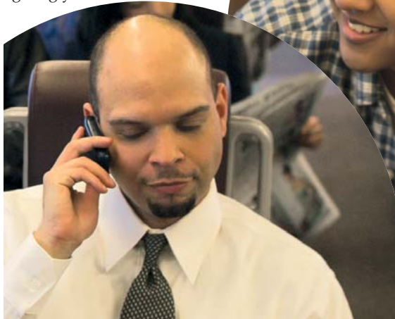
Please cease yelling while celling.

It's amazing how many people actually raise their voices while speaking on a mobile phone. The microphone is so sensitive, you should actually lower your voice. The ear bud and microphone contraption is even more sensitive. You can speak extremely softly