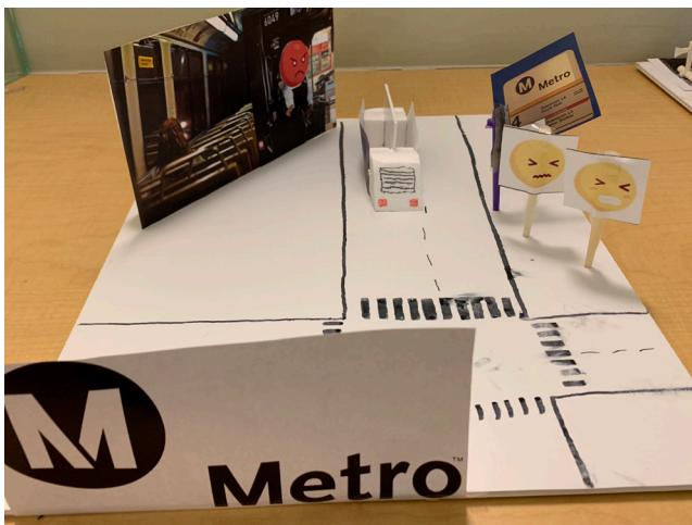
Participatory Workshop at Downtown Women's Center