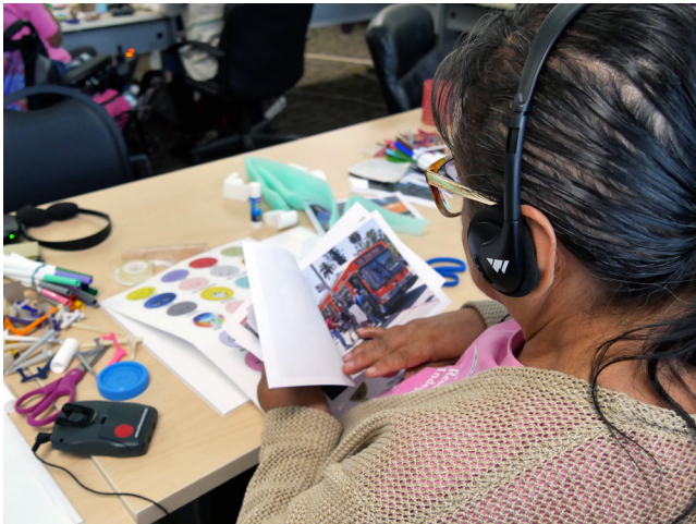
Participatory Workshop at SCRS-ILC