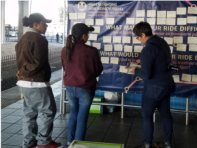
Pop-Up at Willowbrook/Rosa Parks Station