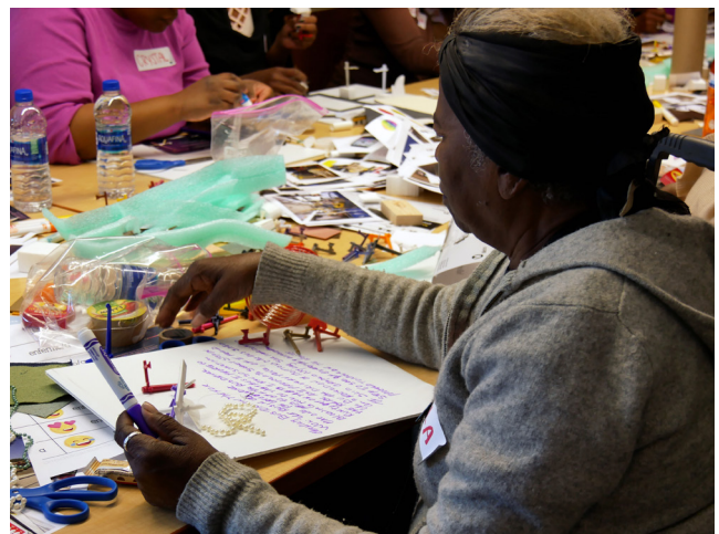
Participatory Workshop at Downtown Women's Center