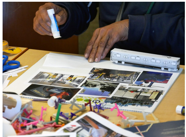
Participatory Workshop with Padres Líderes en Acción