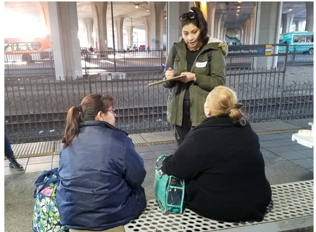
Pop-Up at Willowbrook/Rosa Parks Station