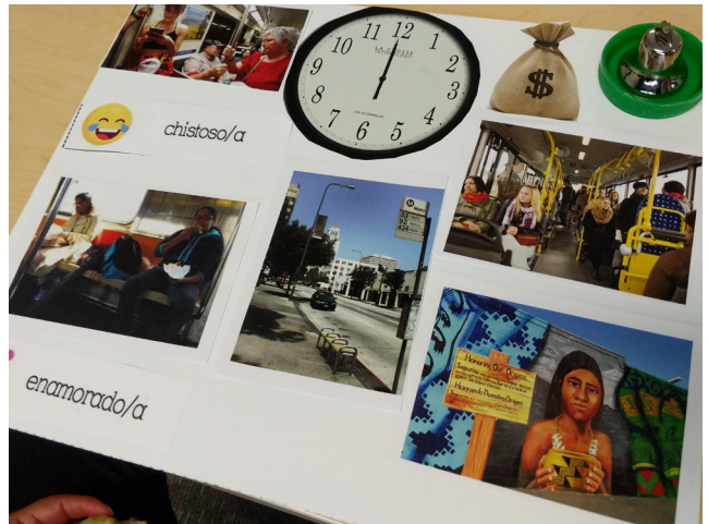
Participatory Workshop at SCRS-ILC