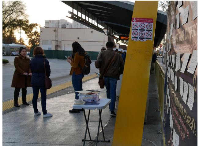
Pop-Up at North Hollywood Station