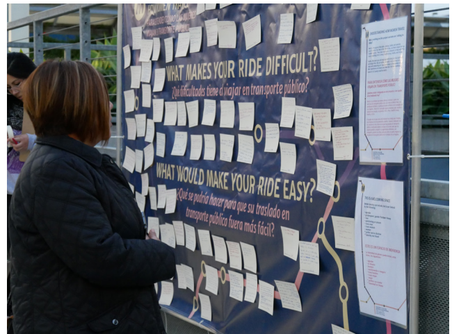
Pop-Up at El Monte Station