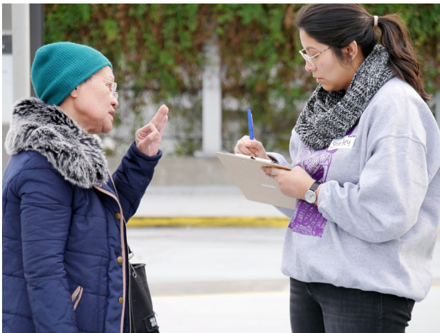
Pop-Up at El Monte Station