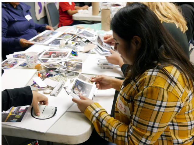
Participatory Workshop with Padres Líderes en Acción