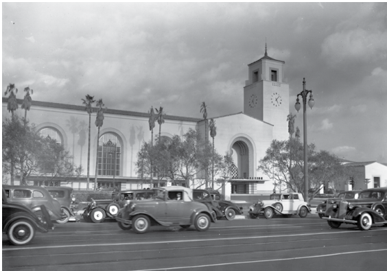
Los Angeles Union Station

The Los Angeles Union Station (LAUS) Alameda Esplanade and Los Angeles Street Improvements Projects will enhance pedestrian and bicycle access and safety to and from Los Angeles Union Station and surrounding communities. These projects implement a piece of the Connect US Action Plan, which was finalized in 2015 and identified active transportation improvement projects in the vicinity of Union Station to create safe access for people walking, bicycling and rolling to and from Union Station. Construction is expected to begin in early 2022. Prior to construction, investigations will be undertaken to identify buried utilities, which may result in exposing archaeological remains that exist below the streets.