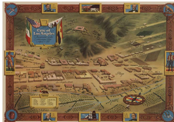
1850 map of Los Angeles

Vineyards, orchards and gardens soon surrounded the Pueblo and the Native American village was pushed south and southeast along Commercial Street. The Zanja Madre , built by Native American workers, irrigated these fields.