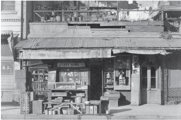
Chinese Merchant Shop, 1920

Chinese vegetable vendors, dependent on the nearby fields, settled close to the plaza. By the 1880s, Chinatown had expanded east of Alameda Street, where LAUS now stands. In the early 1900s, it occupied 15 streets and alleys. Thriving despite substandard tenement housing and poor living conditions, the Chinese residents worked in restaurants, vegetable gardens, as vendors and in laundries, which dominated the streetscape.