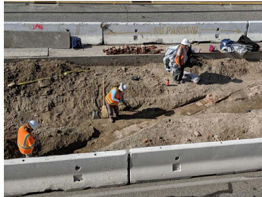
Archaeologists conducting fieldwork

Today, the LAUS area is highly sensitive for prehistoric and historical archaeological discoveries. While the former potentially include remnants of Yaanga, Native American artifacts and burials, the latter is represented by architectural ruins and artifacts from the early Pueblo days, Chinatown and the red-light district's saloons and cribs.