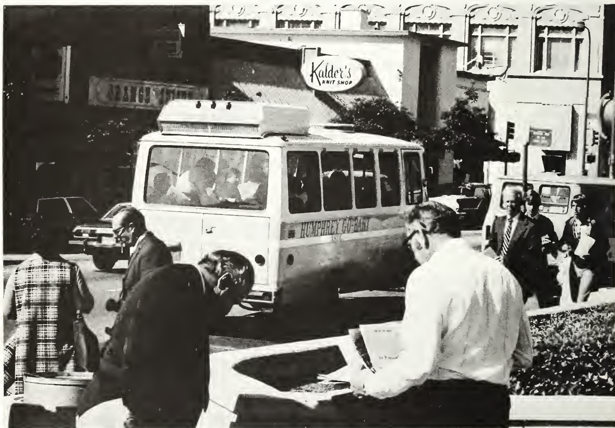
Humphrey Go-Bart, a shuttle service connecting the university of California-Berkeley campus and the Berkeley BART station.