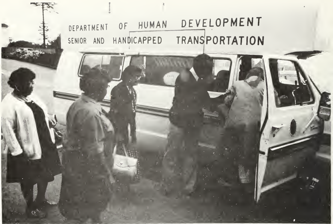
A rural service for the transportation handicapped