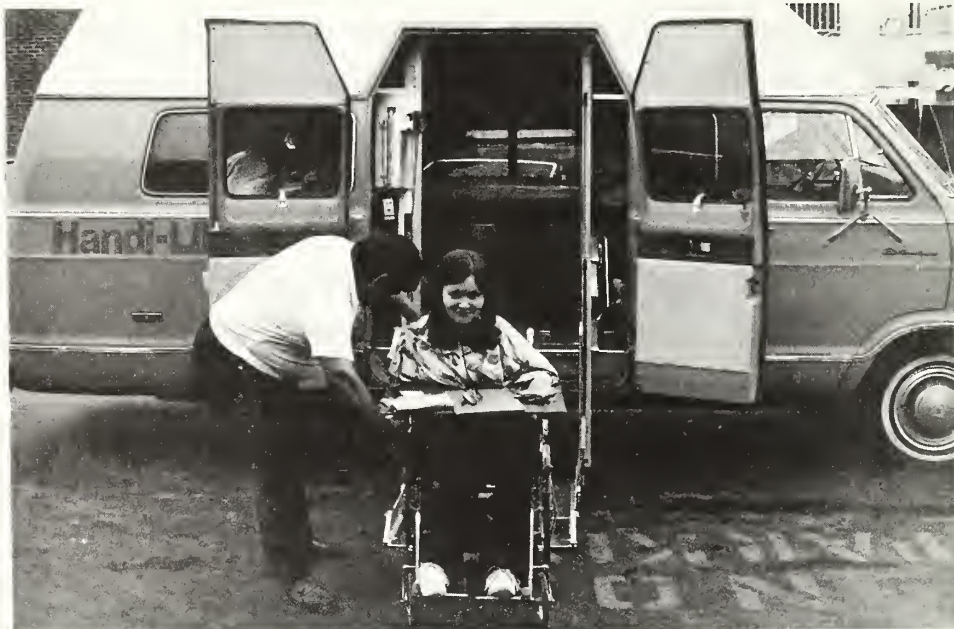
Handi-Lift, a privately-operated service funded by San Antonio's transit authority

Demographic trends and projections suggest that there will be growth in the demand for door-to-door service, in that the size of both the elderly and handicapped populations will increase. Furthermore, improving medical procedures are allowing people to live longer, and the number of elderly and handicapped persons in the work force and, therefore, in need of access to employment sites, is expected to increase, as well. While many of these people are able to use transit and/or have access to automobiles, reductions in federal subsidies for (and likely subsequent service reductions in) the