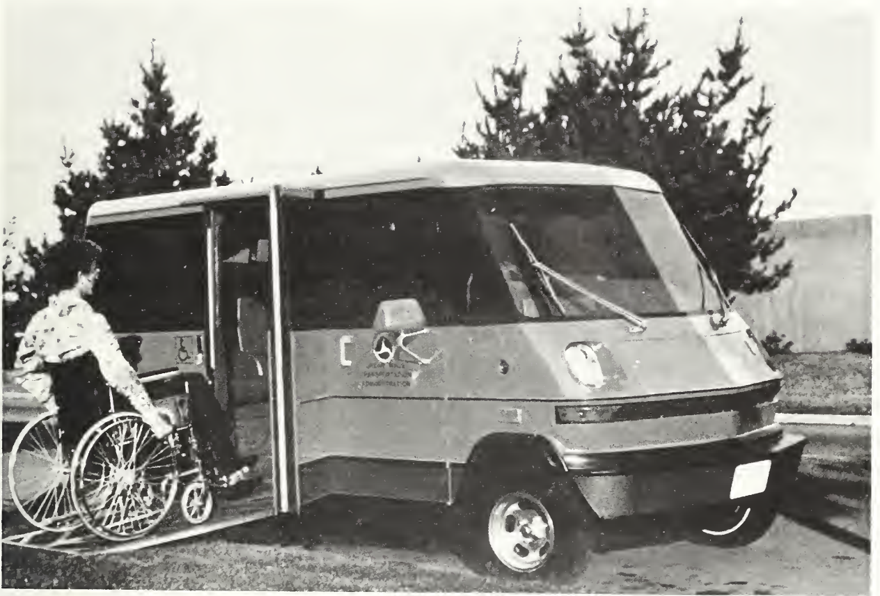
UMTA-sponsored prototype paratransit vehicle