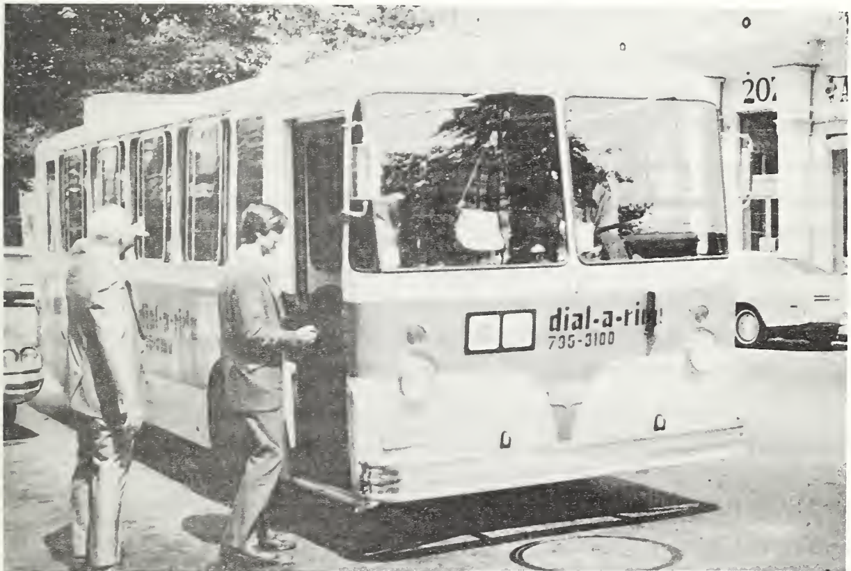
The Haddonfield Dial-A-Ride

At roughly the same time that the Haddonfield project ended, the largest scale paratransit system ever attempted - in Santa Clara County, California was discontinued after six months of operation as a result of various operational and institutional problems. The Santa Clara system was truly an integrated regional system, with both demand-responsive and fixed route elements, and involved computerized dispatch and over two-hundred vehicles.