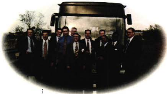
MEMBERS OF THE FTA-LED DELEGATION TO FRANCE VISIT THE IRISBUS MANUFACTURING FACILITY IN LYONS FOR A DEMONSTRATION OF THE CIVIS ELECTRIC VEHICLE. THE CIVIS IS AN OPTICALLY GUIDED BUS THAT CAN OPERATE WITHOUT A DRIVER.

One highlight of the visit was a tour of the Irisbus manufacturing facility in Lyons, which produces the Cavis electric vehicle. The Cavis has an optical guidance system based on image processing, which allows it to operate without a driver. A camera at the front of the vehicle reads coded markings on the road, indicating the trajectory to be followed. FTA expects to receive a similar French delegation to the U.S. in the Spring of 2000 to pursue further exchanges under the MOU.