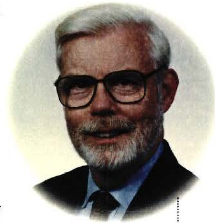
TRANSPORTATION DEPUTY SECRETARY MORTIMER L. DOWNEY GAVE THE KEYNOTE ADDRESS FOR THE LAUNCHING OF FTA'S INTERNATIONAL MASS TRANSPORTATION PROGRAM ON SEPTEMBER 15, 1999.

The session was followed by the signing of a memorandum of understanding (MOU) between FTA and the Department of Commerce on the promotion of transit exports. Under the MOU, the parties pledged to initiate a joint effort to promote the export of transit goods and services, through trade missions, the establishment of a transit export database, and the dissemination to the transit industry of market opportunities abroad. A luncheon following the session featured U.S. Department of Transportation Deputy Secretary Mortimer L. Downey as guest