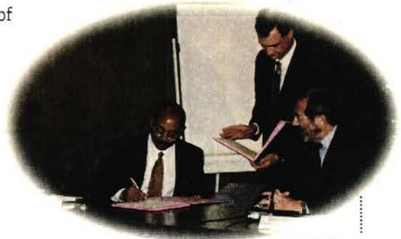
THEN ADMINISTRATOR GORDON J. LINTON SIGNS A MEMORANDUM OF UNDERSTANDING WITH FTA'S COUNTERPART AGENCY IN FRANCE, THE DIRECTION DES TRANSPORT TERRESTRES. THE AGREEMENT CALLS FOR COOPERATION BETWEEN THE U.S. AND FRANCE IN SEVERAL AREAS, INCLUDING NEW BUS TECHNOLOGY, SMART CARDS, AND LAND USE PLANNING.

The group met with French transportation operators and suppliers, made site visits to the Paris and Lyons subway systems, and participated in technical exchanges with the French public sector. The areas explored included public/private partnerships, transit safety and security, and land use and environmental planning.