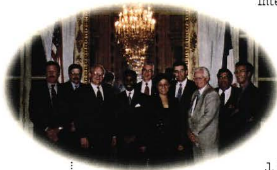
REPRESENTATIVES OF THE FTA, THE FRENCH GOVERNMENT AND THE U.S. PUBLIC AND PRIVATE SECTORS HELD SEVERAL JOINT TECHNICAL MEETINGS IN 1999 TO DISCUSS SUBJECTS OF COMMON INTEREST IN THE FRAMEWORK OF A U.S./FRANCE MEMORANDUM OF UNDERSTANDING.