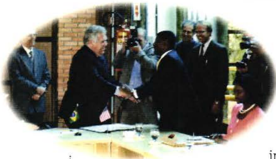
TRANSPORTATION SECRETARY RODNEY E. SLATER AND JAIME LERNER, GOVERNOR OF PARANÁ, BRAZIL, CONGRATULATE ONE ANOTHER FOLLOWING THE SIGNING OF THE MEMORANDUM OF INTENT BETWEEN THE FTA AND THE STATE OF PARANÁ. THE MEMORANDUM PROVIDES A FRAMEWORK FOR TRANSIT RELATED COOPERATION.