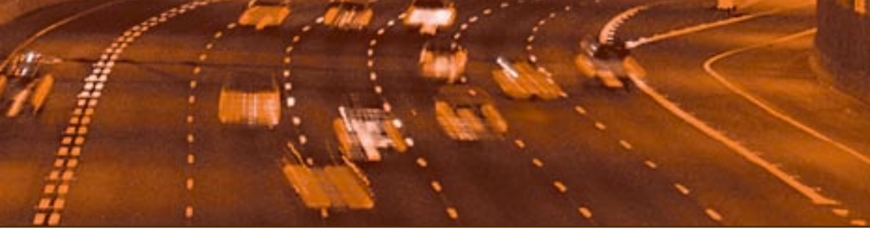
Figure 1. The Partnership