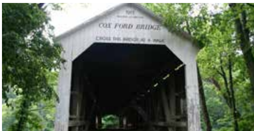
Historic Indiana bridges (top to bottom): St. Joseph, Randolph, Carroll, and Parke.

The PA allows INDOT to more efficiently and effectively preserve and protect historic bridges by identifying bridges with historic value throughout the state and strategically planning to preserve the most significant historic bridges before rehabilitation becomes cost prohibitive. Rehabilitating historic bridges when appropriate instead of allowing bridges to deteriorate to the point of needing replacement not only saves a historic resource, but also reduces the resource consumption, environmental impacts, and energy use associated with demolition and new construction. Also, the time to advance most bridge replacement projects to construction under the PA has been reduced from five or more years to a year or less.