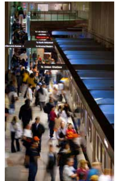
LA Metro red line at Union Station.

The LACMTA's Board has put sustainability front and center in its vision for the agency's future. In 2008, voters approved Measure R , which authorizes LACMTA to spend a projected $40 billion on traffic relief and transportation upgrades throughout the county over the next