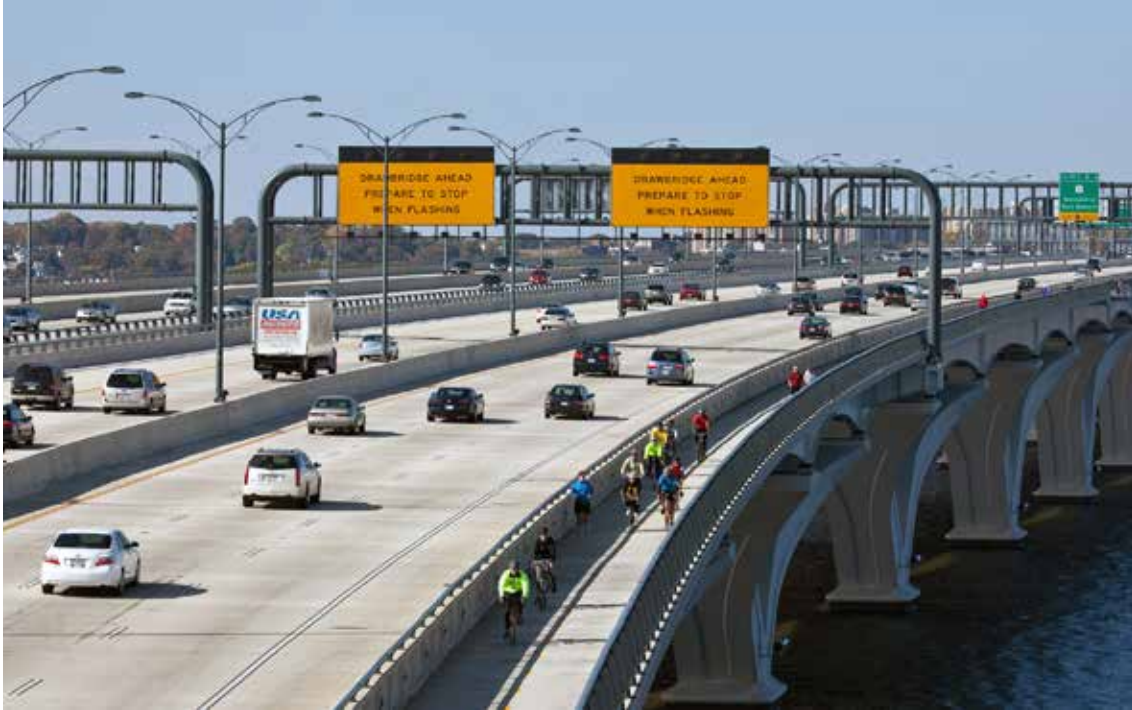
Bike lane along Woodrow Wilson Bridge that spans the Potomac River.

By integrating data sets from dozens of statewide databases and giving users the power to analyze them at the click of a mouse, MOSAIC will help the agency swiftly identify project options to optimize environmental, cost, mobility, safety, and economic considerations, and use this analysis to target transportation improvements that offer the best sustainability performance.