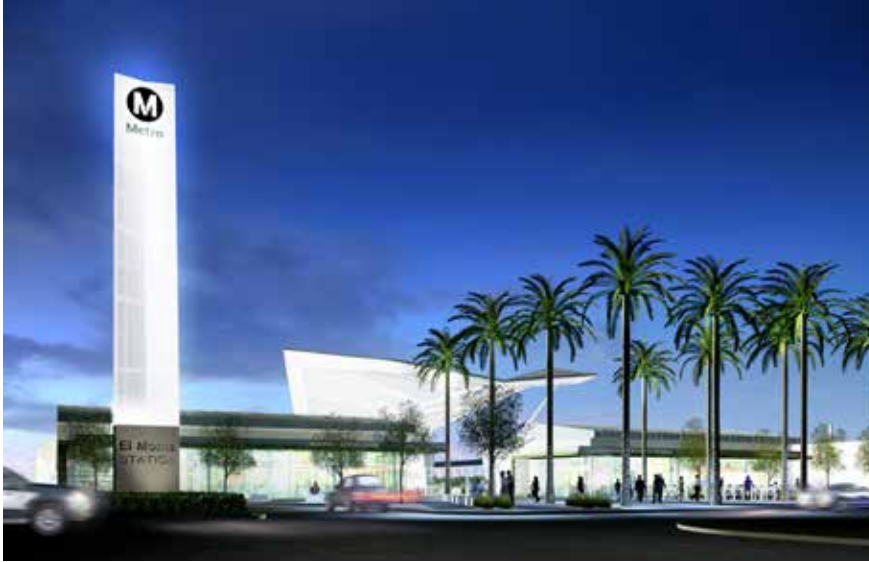
LACMTA bus hub.

facility to be awarded a gold Leadership in Environment and Design (LEED) rating. The new building cuts energy use by 25 percent and water consumption by 50 percent compared to a conventional structure, thus saving LACMTA over $75,000 in utility costs each year; 24