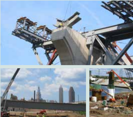
Cleveland Innerbelt Bridge.

In February 2009, the Ohio Department of Transportation initiated the first of two projects designed to replace the aging steel truss bridge that carries Interstate 90 over the Cuyahoga River Valley and into Cleveland's central business district. The first Innerbelt project, developing a new westbound bridge adjacent to the existing bridge, demonstrates how Ohio DOT is working to make its major transportation investments leaner and greener by reducing cost, maximizing benefits, and conserving resources.