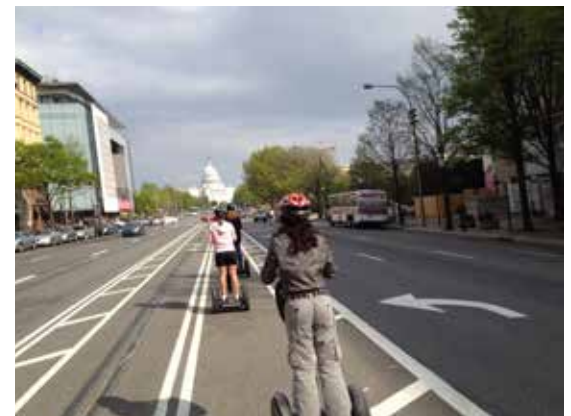
DC visitors enjoy sightseeing with Segues, using the proper bike lanes for safety.

The District of Columbia Department of Transportation’s (DDOT) Sustainability Plan identifies eight priority areas for sustainability and establishes goals, actions, measures, and targets for each. The priority areas are promoting transportation and land use linkage; improving mode choices, accessibility, and mobility; making effective cost assessments in decision-making; supporting the economy; improving DDOT operations and project development processes; protecting the environment and conserving resources; climate change adaptation; and promoting livability and safety. For each priority area, measures and targets are identified, such as reduction of annual greenhouse gas emissions from DDOT projects by 5 percent annually.