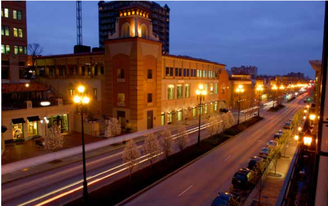
Country Club Plaza Shopping Center in Kansas City, Missouri, at dusk.

binder to drive off moisture and make it pliable. Warm-mix manufacturing technologies brought to the United States from Europe in the early 2000s save energy and costs by allowing for production and placement of asphalt at lower temperatures. Less heat means less fuel and lower emissions and potentially lower fuel costs. Using warm-mix asphalt (WMA) can reduce energy consumption during the manufacturing of the asphalt pavement mixture by an average of 15 to 30 percent, which decreases total life-cycle greenhouse gas emissions by 5 percent. 9 In a two-year performance study conducted for Virginia Department of Transportation, which is one of the states beginning to use WMA, the Virginia Transportation Research Council estimated that using warm-mix asphalt as part of the DOT's maintenance program could provide Virginia with about a $1.15 million annual savings over the cost of hot-mix asphalt, which they attributed to the longer lifespan of WMA compared to regular asphalt. 10