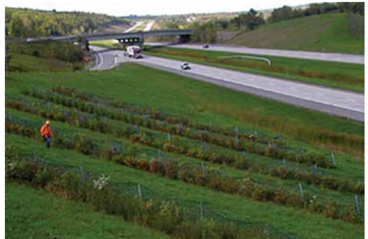
Living snow fences.

GreenLITES was recognized in 2009 by the Council of State Governments under their prestigious Innovations Award program, and in 2010 received the AASHTO President's Award for Environment.