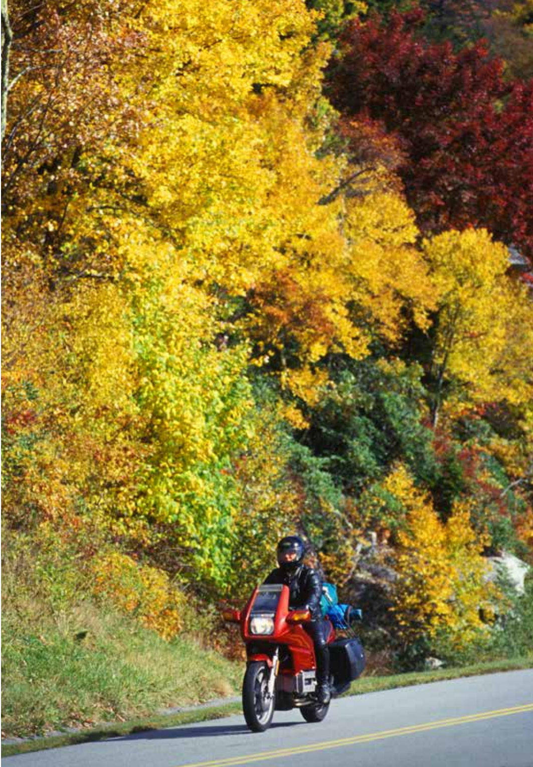
Motorcyclist travels along the Blue Ridge Parkway.