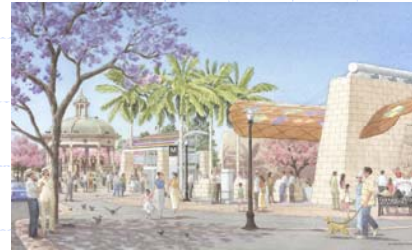
Boyle Heights/ Mariachi Plaza