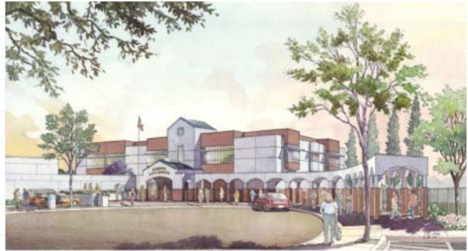
LAUSD Ramona Opportunity High School