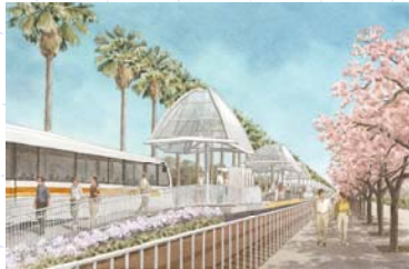
LittleTokyo/ Arts District