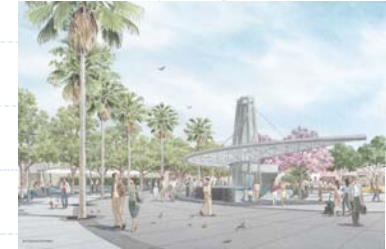
1 st /Soto