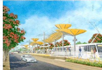
East Los Angeles Civic Center