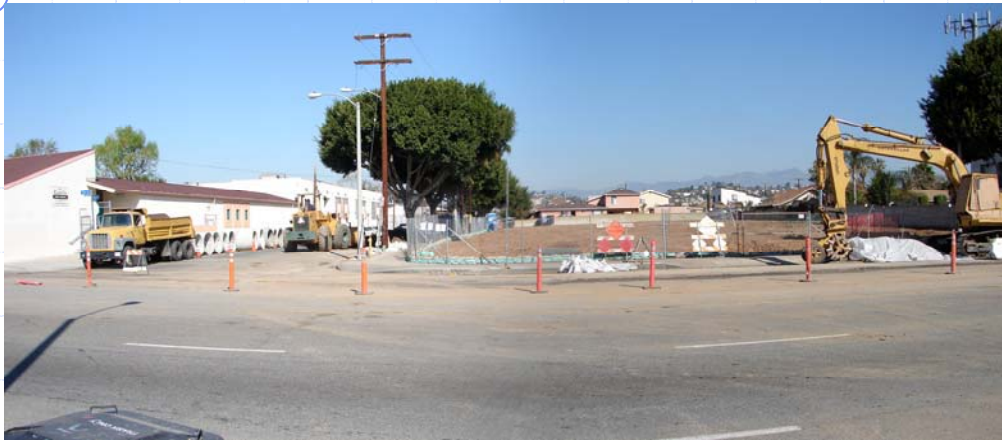
3 rd Street and Alma Avenue