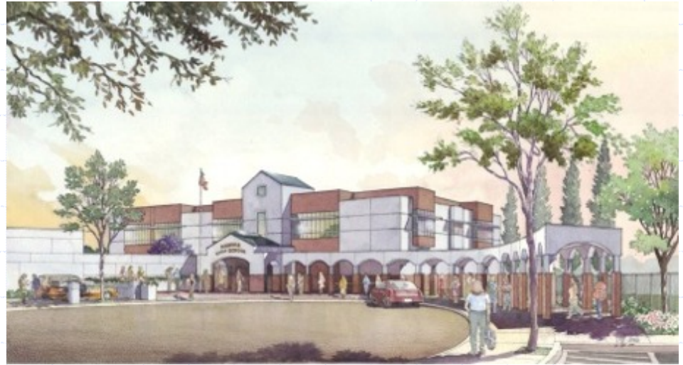
LAUSD Ramona Opportunity High School