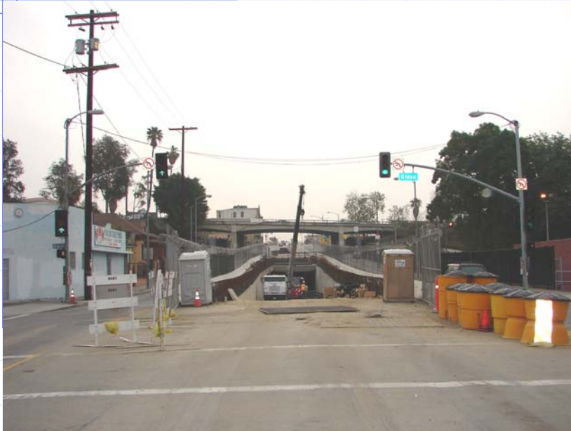
West Tunnel Portal at 1 st /Gless