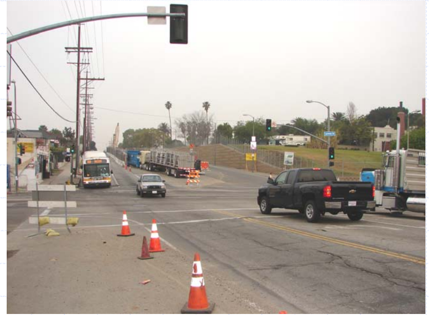
East Tunnel Portal at 1 st /Lorena