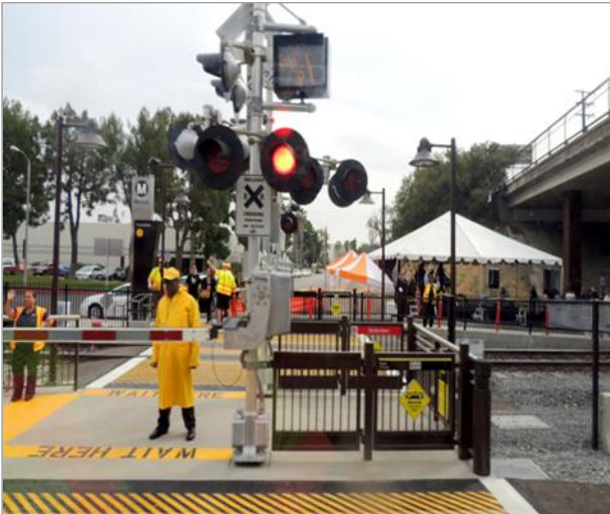
MBL Pedestrian and Swing Gates as installed on MGL and Expo Line