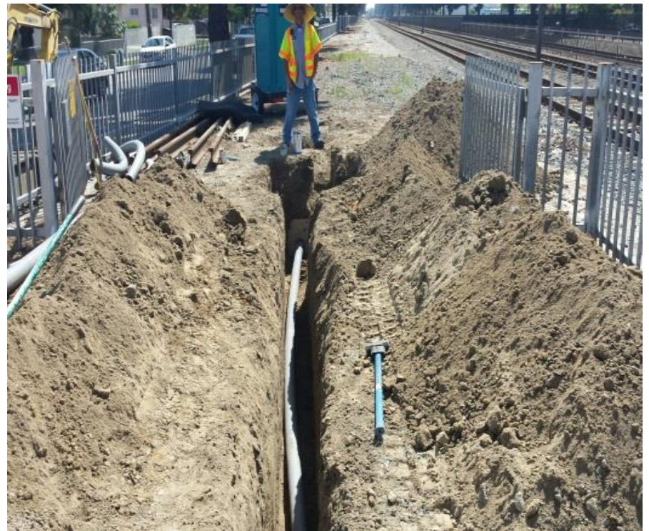
Construction Activity. Conduit Installation.