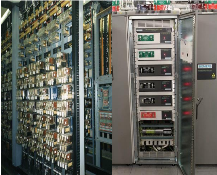
Old Relay Train Control