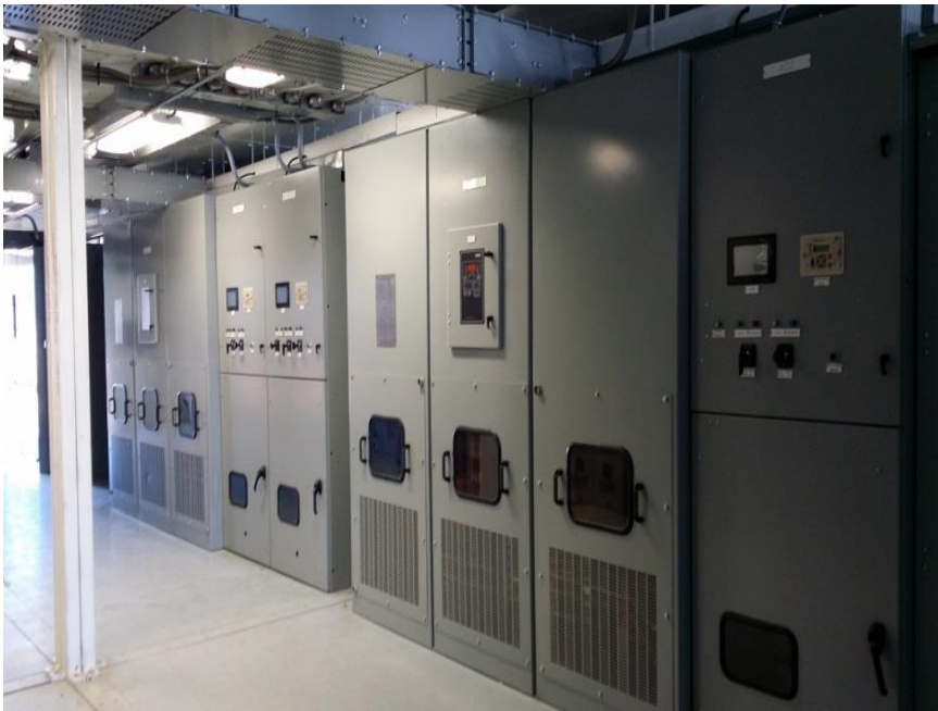
Typical TPSS Equipment