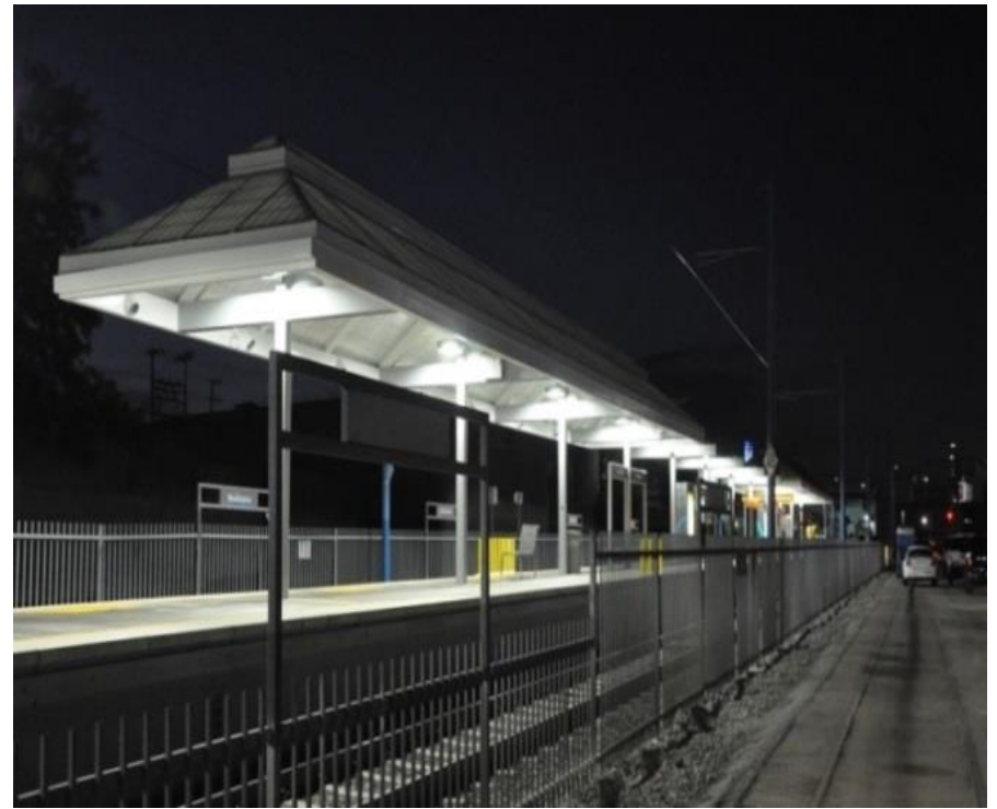
After LED Lighting Improvements