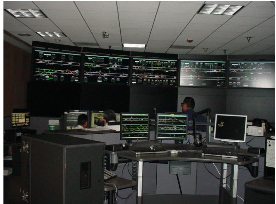
Rail Operating Center (ROC)