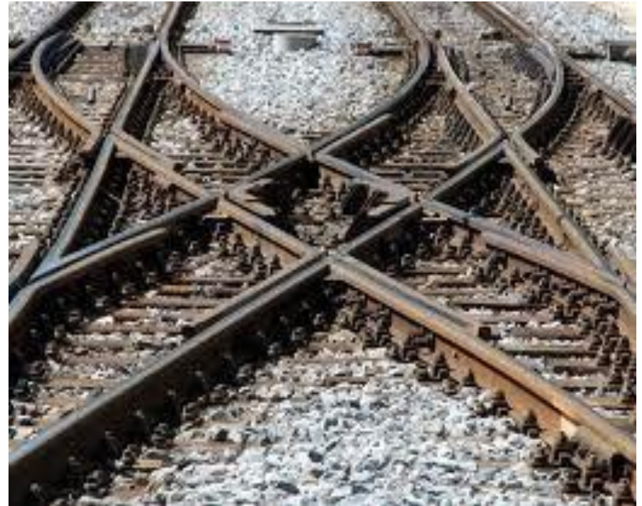
Project adds 6 Crossovers